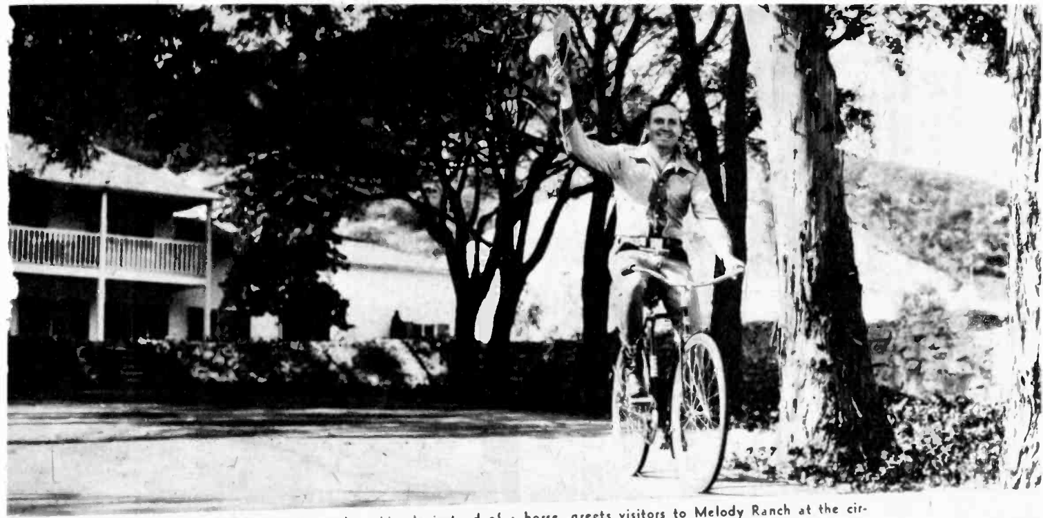
GENE AUTRY , astride a bicycle instead of a horse, greets visitors to Melody Ranch at the circular driveway where giant eucalyptus trees form a perfect horseshoe.