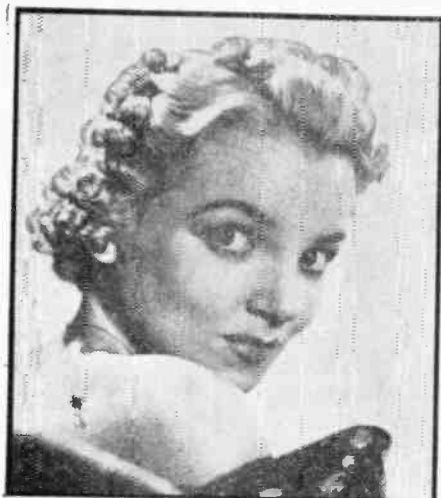
HELEN O'CONNELL sings with Jimmy Dorsey and his orchestra over Mutual, Saturdays at 2 o'clock.