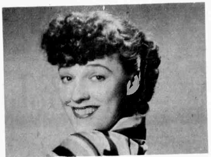
GLADYS HEEN is the vivacious actress cast as Torchy Reynolds.