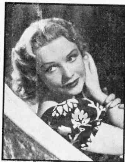
MADELINE CARROLL makes a guest appearance on "Cavalcade of America," Monday, Aug. 3, (KFI, 8:30 p.m.) See Pre-Cast this page.)