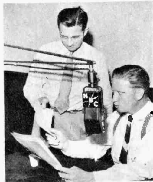
7 Below, a last-minute news flash is rushed from the teletype to the studio by Editor Miller. Late baseball scores usually come in after Wald is on the air.