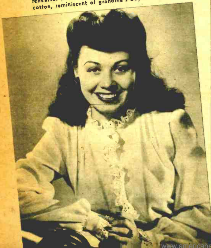
▲ FEMININITY IS EXEMPLIFIED by diminutive Connie Haines, warbler on Abbott-Costello's NBComedy fest. Anything with ruffles is good style and Connie's white Labtex blouse boasts eyelet-embroidered frills.