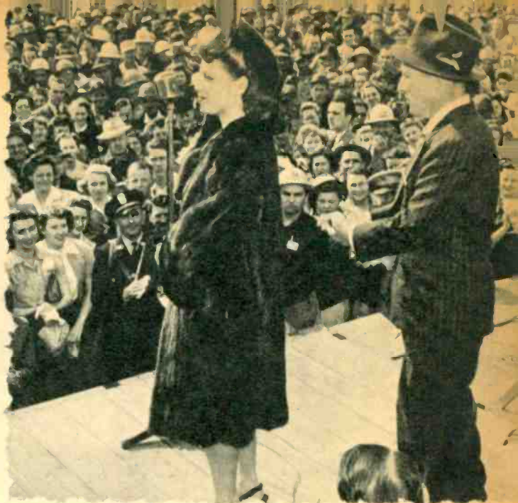
▲ SINGING TWOSOME make an applauded appearance at Richmond Shipyard No. 3 of Kaiser Company. (Note Der Bingle's staid attire—unusual).

for the first time in 1940 with the Eddie Cantor program, she had just one ambition: to meet Bing. But she couldn't quite get the nerve to go up and introduce herself. She slipped into the studio where Bing was rehearsing and sat far back in a corner alone.