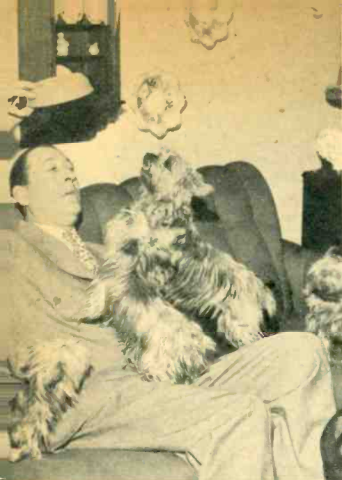
▲ THESE ARE FOUR OF THE SEVEN Treacher pets. Nobody, we are sure, has mastered the ability to tell them apart but their owners. As you can see it is mealtime.