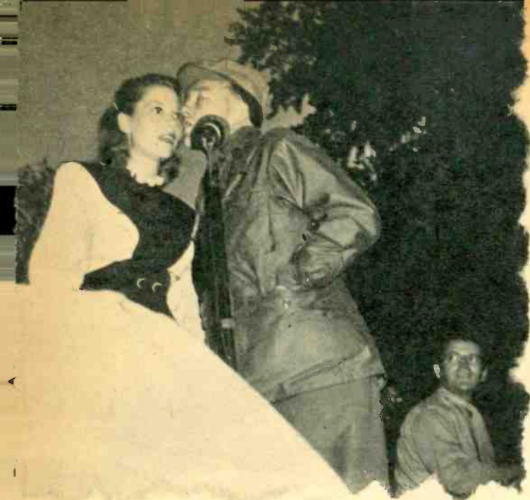
▲ LAST YEAR , Dinah and Bing were mentioned by General Eisenhower as two stars his men most wanted to see. Result shown above: Groaner and Dinah giving a show for engineers overseas.