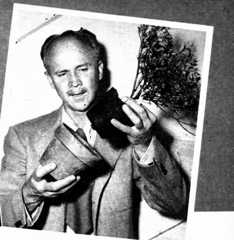
FOR AZALEAS, LITTLEFIELD RECOMMENDS transplanting in peat moss after the ground has formed a solid base in the pot and the roots have become crowded.