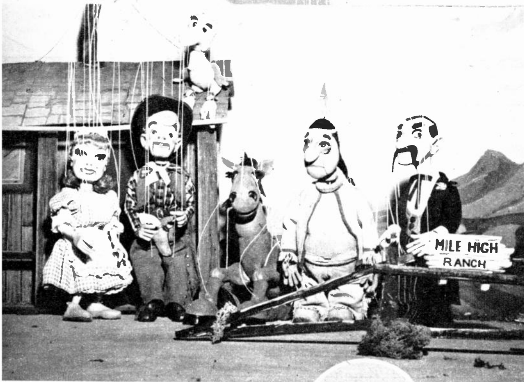
“COZY,” “CYCLONE,” “Burgess” (on the roof), faithful horse “Cucamonga,” “One Lone Feather” and the sinister “Major Richmond” are the principals in the Coast’s only marionette show, “Adventures of Cyclone Malone.”

Monday- Friday 6:45 p.m. NBC-TV, Channel 4, KNBH