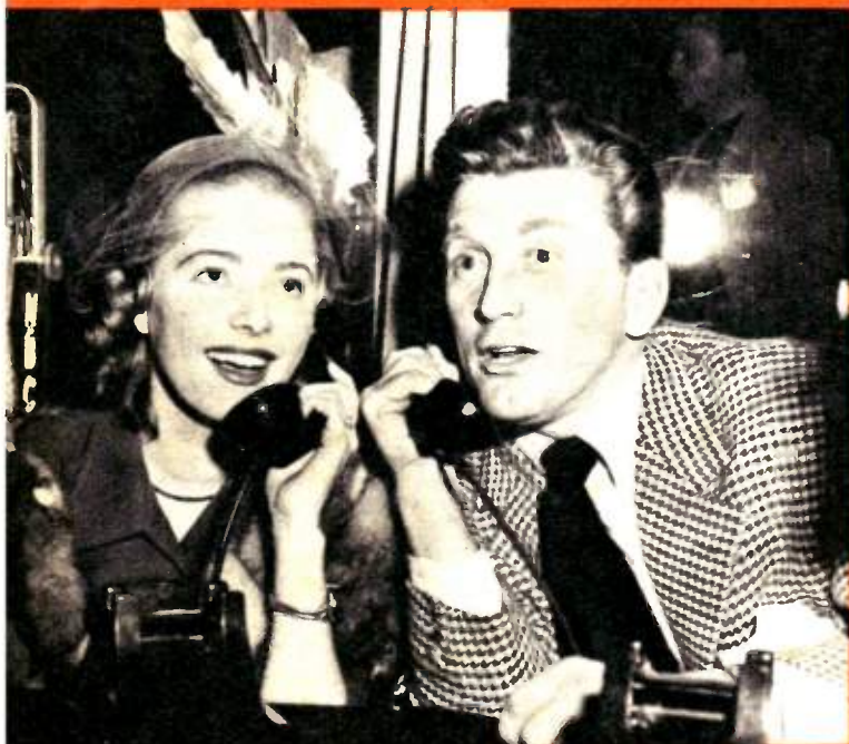
GARRY MOORE'S daytime show on CBS features the return of Bill Comstock as "Tizzie Lish." Garry is certainly happier about it than he looks.