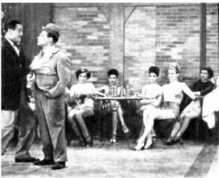
▲ WILLIAM BAKEWELL'S INTENT TO KILL is only in the script during this telecast of "Pardon My Pinky," starring Pinky Lee (in the hat). Show was first in the "Hollywood Premiere Theater" series on KNBH Wednesday nights. Girls are Earl Carroll love-lies.