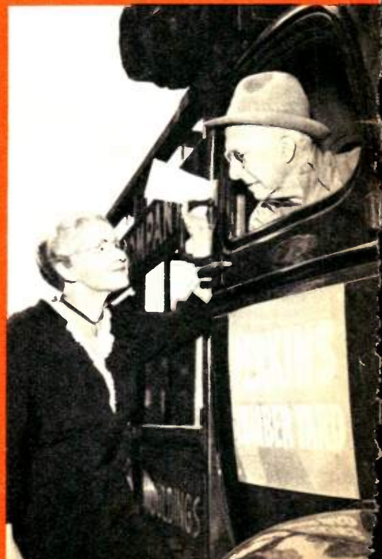
THE "PERKINS" lumber yard in "Rushville Center" is still going after fifteen years on the air. Here "Ma Perkins" and "Shuffle Shober" get ready for the daily rounds.