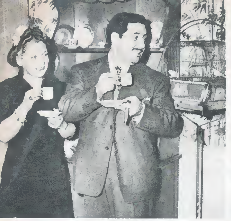
THE COLORFUL DINING ROOM is the home of "Throcky," Betty's bright yellow canary. "Ginger," a black spaniel, and "Throcky" are the household pets.