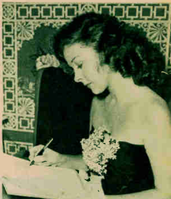
▲ SUSAN HAYWARD'S fingers are busy doodling on her CBS "Lux Radio Theater" script, but her mind is busier as she mentally "woodsheds" for her role in the dramatic vehicle "My Foolish Heart."

The thing I remember most is the way, just before I'd click the shutter, I'd hear him titter a little to himself. I guess he was enjoying it too.