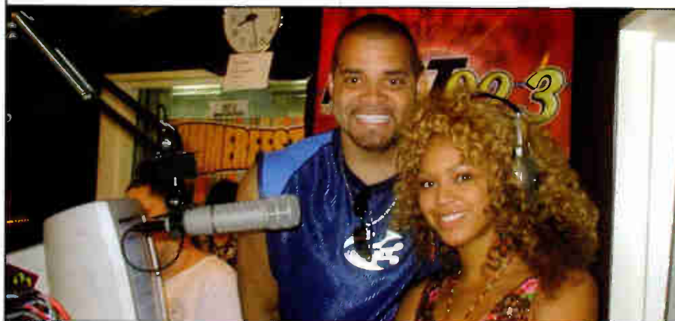
Beyoncé Knowles, right, co-star of Austin Powers in Goldmember and lead singer of Destiny's Child, tells KHHT (Hot 92.3) Los Angeles morning man Sinbad about her acting career and future music plans.