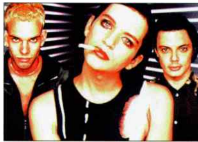
Placebo: Stefan Olsdal, Brian Molko, Steve Hewitt

Anesthetizing that sort of emotional pain is the main theme of Placebo's "Without You I'm Nothing," the follow-up to 1996's self-titled Caroline debut. Molko, who has described his music as "punk pop for postponed suicides," exorcises the anguish of his own decaying relationships and in doing so ends up with an odd combination of dissonance and haunting calm. Of the album he says, "It's kind of a post-party vibe. It's a bit of a hangover record, and it sort of encapsulates an all-pervading emotion, sort of like one of post-coital depression."