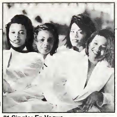
#1 Single: En Vogue

May 26, 1990 The square bullet indicates strong upward chart movement. Alphabetical and Publisher list on page 8