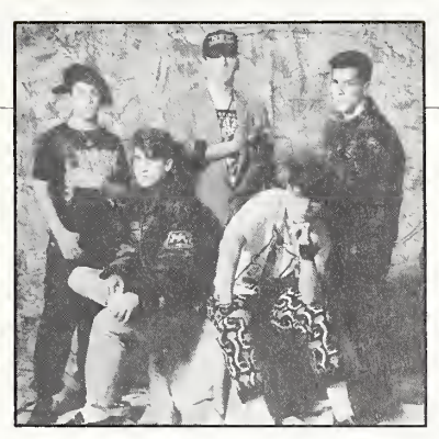
#1 Debut: New Kids on the Block #50 To Watch: Slaughter #47