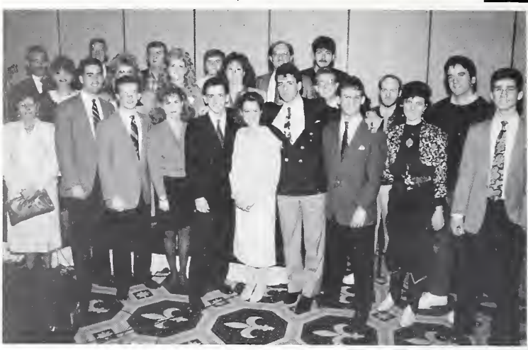
New Haven Records recently hosted a listening party debuting Cronicle's new album, entitled Willing Servants . Cronicle, the newest addition to New Haven's roster, is becoming one of Southern gospel's most popular groups. Pictured at the recent listening party are a few of those who attended, including Cronicle, New Haven Records' staff, and several staff songwriters.