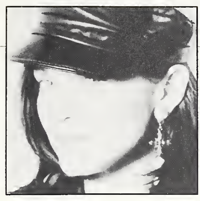
#1 Single: Madonna

The square bullet indicates strong upward chart movement. Alphabetical and Publisher list on page 8