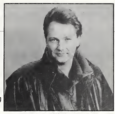
#1 Single: Steve Wariner

May 26, 1990 The square bullet indicates strong upward chart movement. Alphabetical and Publisher list on page 8