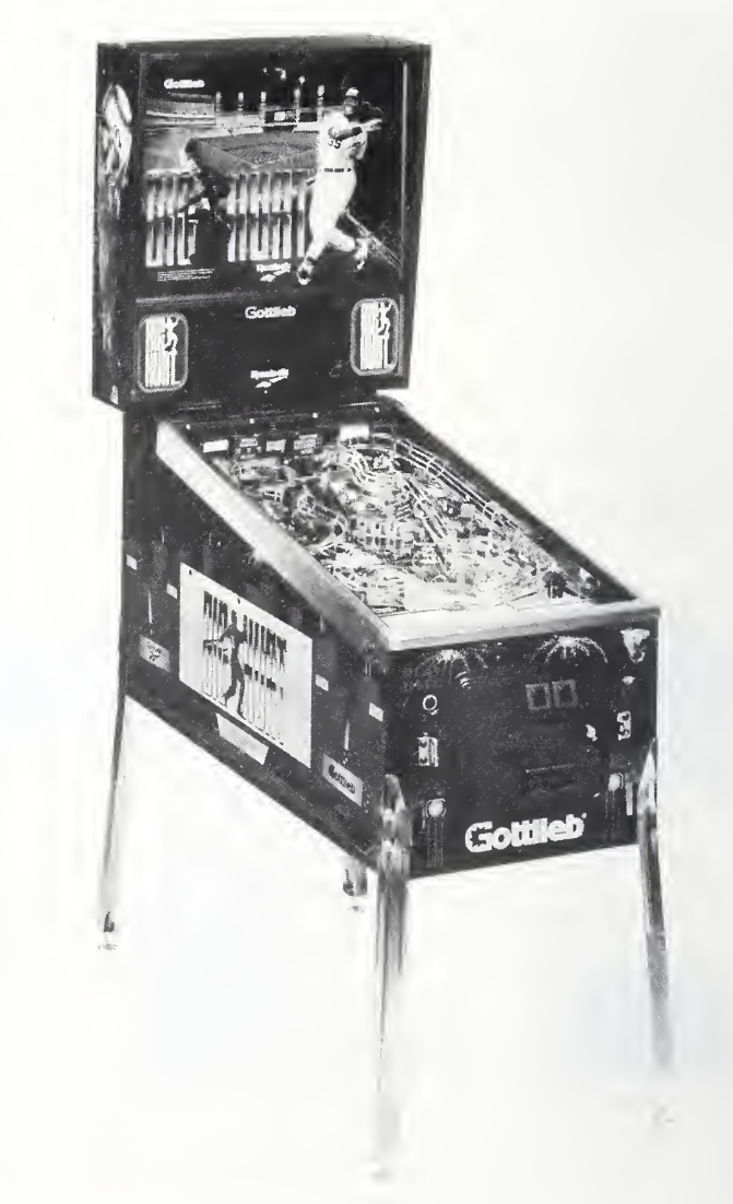
Gottlieb's Big Hurt.

Further information may be obtained through factory distributors or by contacting Premier Technology, 759 Industrial Drive, Bensenville, IL 60106.