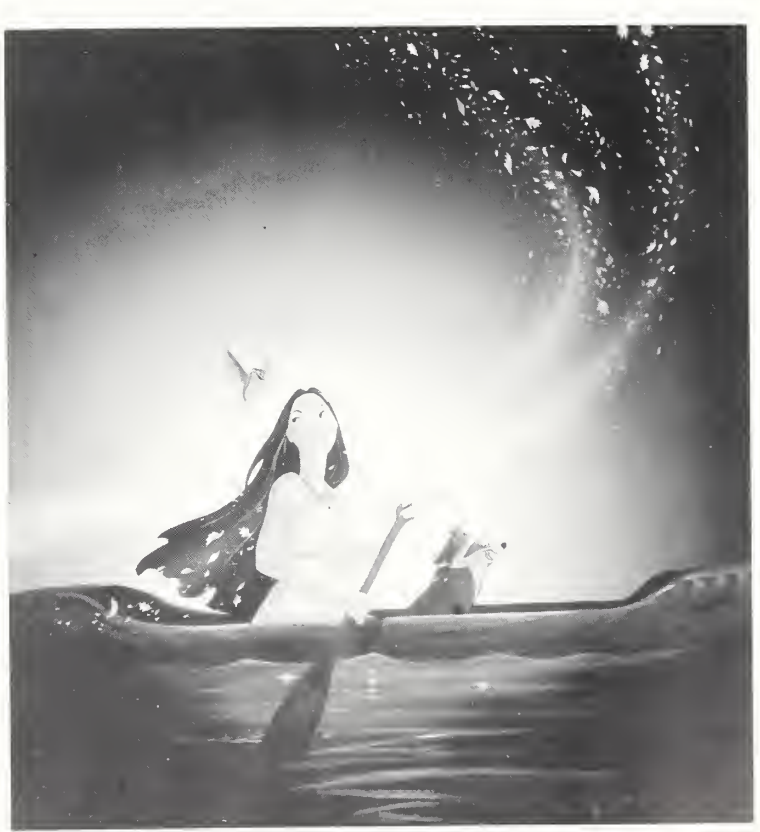
Pocahontas heading "Just Around The Riverbend" with Flit, Meeko and all the "Colors Of The Wind."