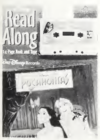
Read Along and Sing Along