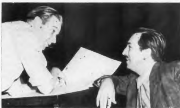
One of the Most Talented gents in all Hollywood is Leigh Harline, shown at right above. Leigh is head of the Walt Disney music department. His music for the Disney feature, "Pinocchio" won for Harline the 1941 Academy Award. He's been with Disney (shown at left) since 1932, before which he put in several years in radio work in San Francisco and Los Angeles. The underscoring for "Snow White and the Seven Dwarfs" also was written by Harline, and he's the composer of musical scores of more than 60 short Disney subjects.