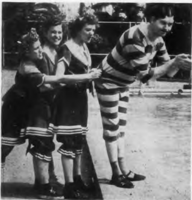
Beach raiment of the turn of the century becomes Patty, Maxene and La Verne about as much as it did the wearers of the period. And that antiquated aqua-suit that film and stage comedian Milton Berle is wearing was really dug from the archives. The gals are to be featured with Benny Goodman's renovated band on the Holland Furnace commercial starting Thursday night via NBC.