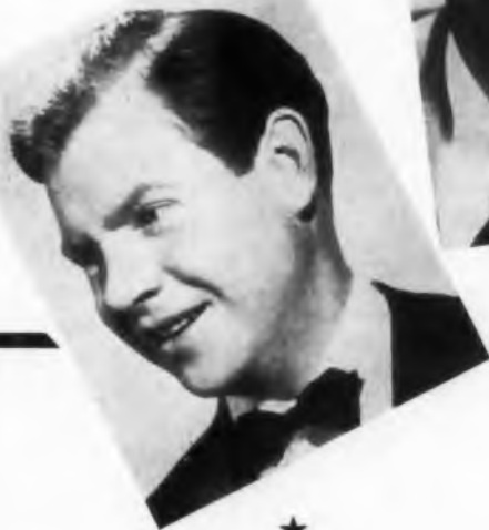
★ CLAUDE THORNHILL AND HIS ORCHESTRA