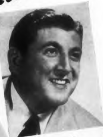
★ TONY PASTOR AND HIS ORCHESTRA

Returning by Popular Demand to Glen Island Casino for the Fall Season