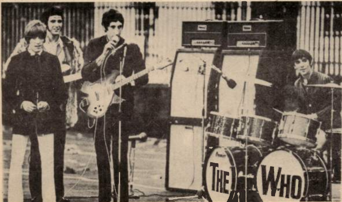
THE WHO — maybe a TV show soon

The movie business and pop are becoming closely connected. Many stars have begun their own production companies, and the newest angle is to film shorts of groups performing their hit songs. The Move did this recently with "Night of Fear," and the Beatles did likewise with "Penny Lane."