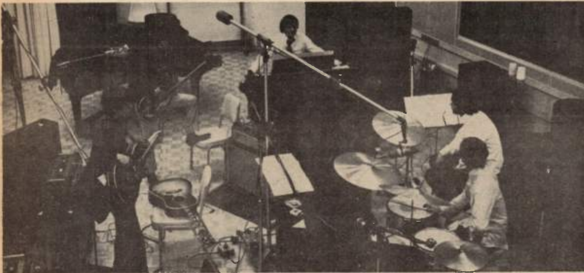
THE BUCKINGHAMS ... at their rush recording session

"Everybody has a great deal of faith in the new fresh sound of the Buckinghams."