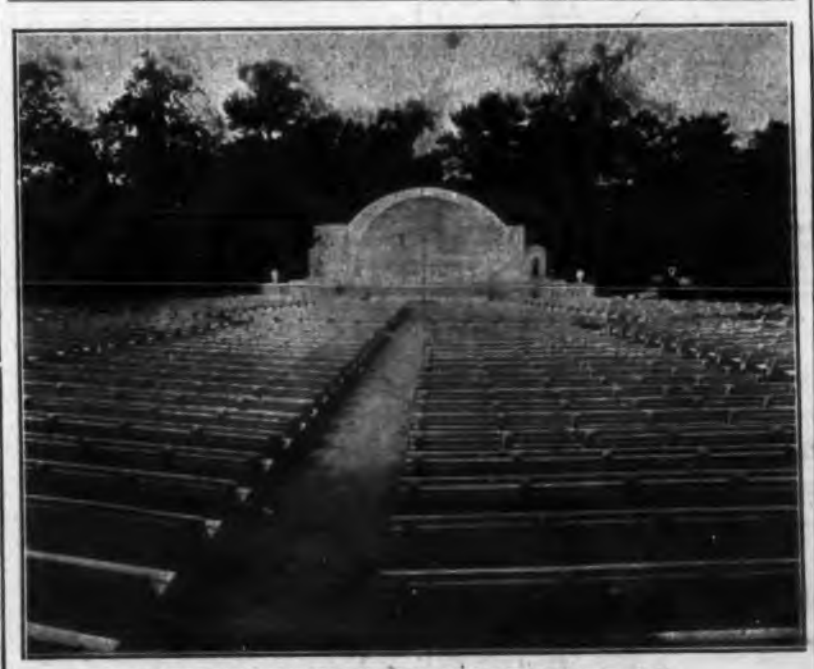
SHELL AND STADIUM IN OVERTON PARE, MEMPHIS, TENNESSEE

Technical and vocational education and apprenticeship.