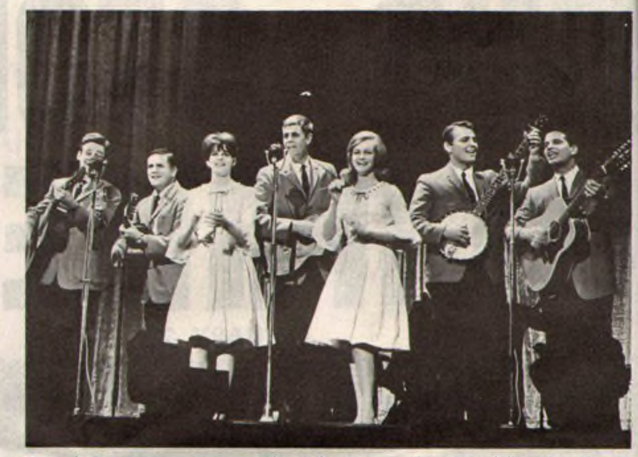
One of the newer groups on the folk scene is the Youngfolk, who give a lighthearted, happy glow to any audience. They'll go places! (and not only because they look so good!)