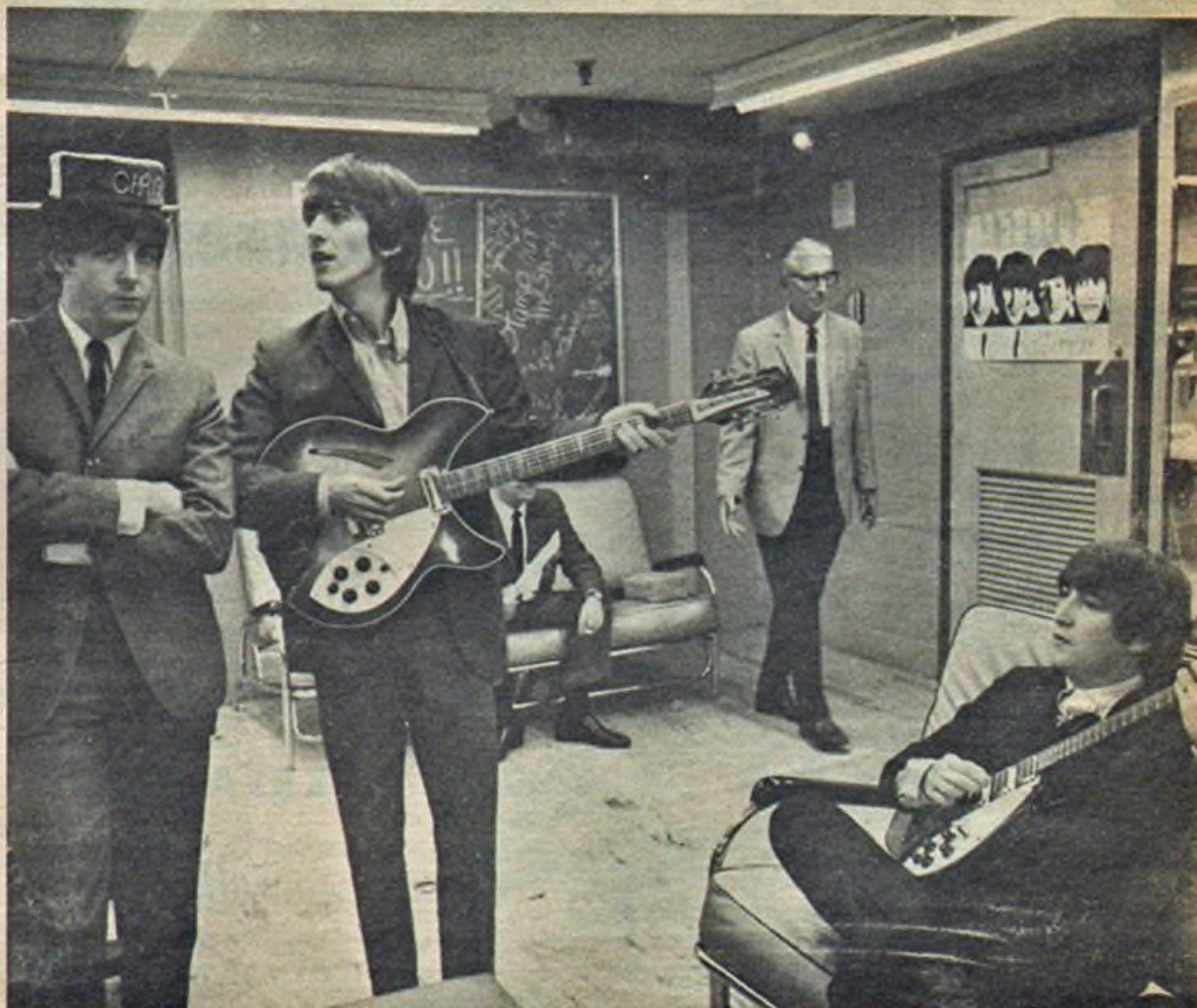
Like a postman who goes for a walk on his day off, THE BEATLES relax for a few moments by strumming their guitars. The kookie hat is a gift from an admirer who finally got to see them for a few seconds.