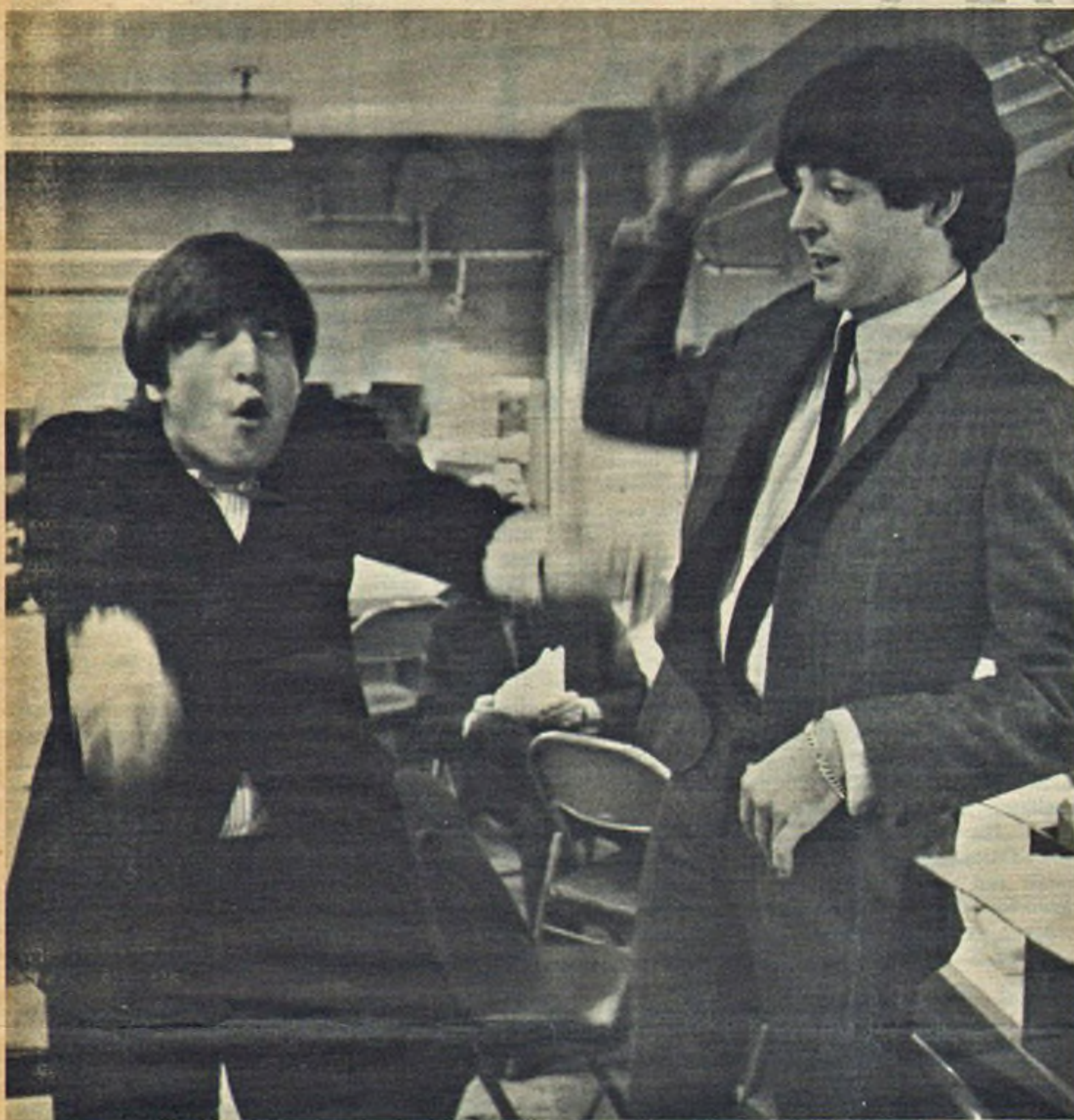
ANOTHER OF THE EXCLUSIVE BEATLES photos to appear in the BEAT. The camera caught the pair in an unguarded moment inside the private dressing rooms set up for the group while they worked long hours on their island adventure story.