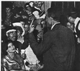
MARVIN GAYE ENTERTAINS private party. It was just such a party that led to his fabbed success as singer both in ballads and rockers. Watch for Marvin's new album, and read about his meeting with DEREK TAYLOR on Page 1.