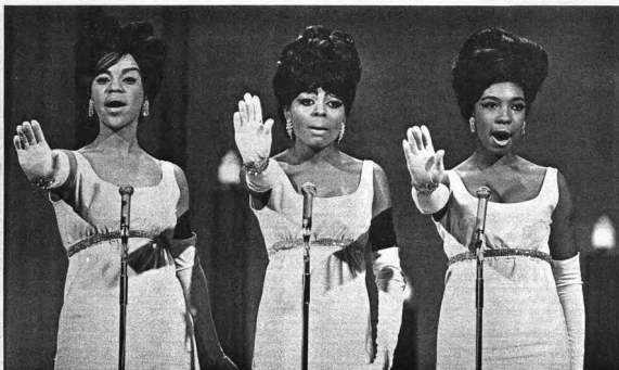
TOP RECORDING TRIO — THE SUPREMES, as they appeared on last week's "Hollywood Palace," on ABC Television. Show was hosted by film star Tony Randall. SUPREMES are rated as the number one female vocal group in the nation since THE ANDREWS SISTERS and THE McGUIRE SISTERS. Their top hit STOP! IN THE NAME OF LOVE has hit the top. (l-r) Florence Ballard, Diane Ross, and Mary Wilson.