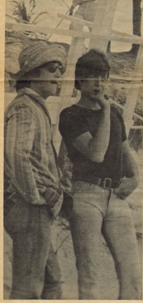
ANXIOUS MOMENT IN NASSAU as two BEATLES watch Ringo flounder in surf during filming sequence with stone idol. Photo snapped by SANDY FRAZER of Palos Verdes Estates - whose exciting vacation with the BEATLES will be seen next week!