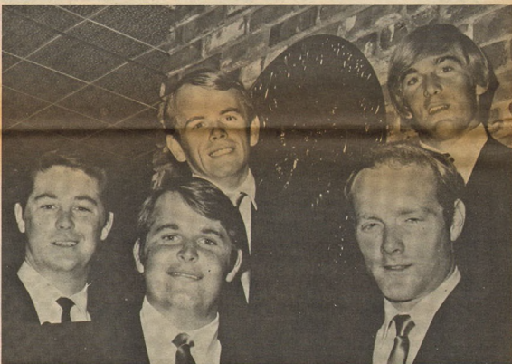
THE FABULOUS BEACH BOYS have done it again! They have a new smash record, "HELP ME, RHONDA," and a top-selling album, "The Beach Boys Today." They earned nearly a million dollars last year in less than 80 concerts, and the Southern California stars should do even better this year.

BULK RATE U.S. Postage PAID Permit No. 25497 Los Angeles California