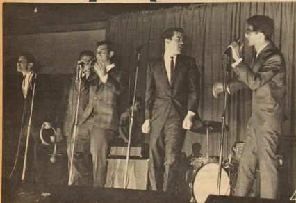
THE KRLA DEEJAYS ham it up on stage at Long Beach Arena