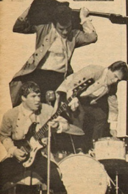
PAUL REVERE AND THE RAIDERS - colorful, exciting entertainers.