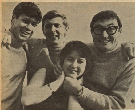
THE SEEKERS may have found what they were seeking. The Australian group has a smash hit in "I'll Never Find Another You."