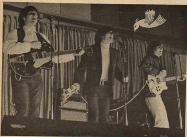
THE BYRDS were cheered almost as wildly as The Stones