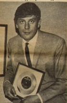
Herman's Hermits, the Animals, Bobby Vee, and Brenda Lee!

They are "sick of being tagged Irish." According to the five-man group: "It gives the impression we've just come over on the late cattle boat."