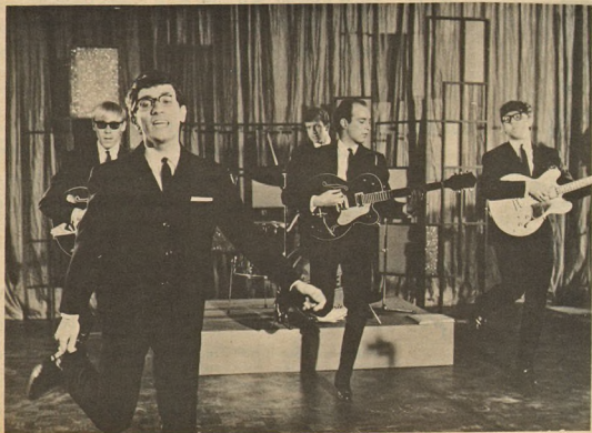
FREDDIE AND THE DREAMERS DO SEVERAL OF THEIR BIG NUMBERS IN MOVIE