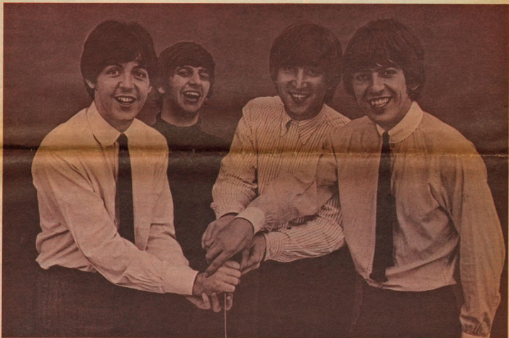
Here's Exclusive Preview of Beatle's New Album

KRLA scored another world-wide "first" last week. And as a result, KRLA listeners became the first anywhere to hear the exciting new Beatles' album, "BEATLES VI"