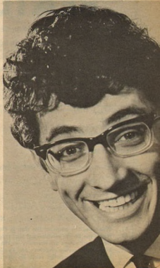
FREDDIE IS ONE OF TODAY'S TOP STARS

Filed in technicolor and Cinemascope, the 'Seaside Swingers' features Freddie and his cohorts in several good production numbers.