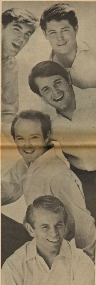
THE BEACH BOYS REMAIN AMERICA'S MOST CONSISTENT HIT-MAKERS. 'HELP ME RHONDA' IS STILL ONE OF THE TOP SONGS ACROSS THE COUNTRY.

He listed these as quality, consistency and allowing the listeners to select the music and type programs they want to hear.