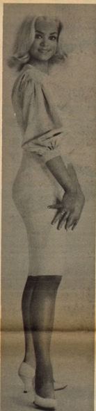
"WHAT THE WORLD Needs Now Is Love," sings Jackie DeShannon. Jackie shouldn't have any trouble finding her share of it.