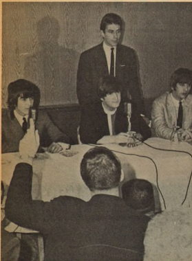
AS BEATLE PRESS OFFICER