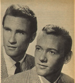
RIGHTEOUS BROTHERS STAY WITH WINNING SOUND