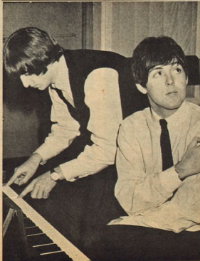
PAUL and RINGO