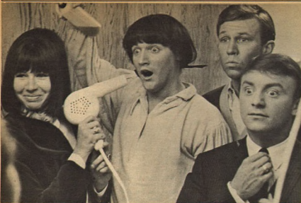
BACKSTAGE AT "SHINDIG," P. J. Proby clowns around with Dick and DeeDee and Gerry Marsden. A short time later came the now-famous Proby-Good blowup. Dick, who had just signed himself and his partner for four more "Shindig" shows, wound up going to the hospital for a throat operation instead. Only DeeDee and Gerry seem to have escaped the jinx that struck that day.