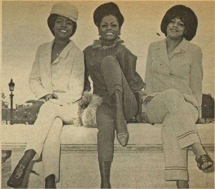
THE SUPREMES STILL REIGN SUPREME , sending still another fabulous record up the charts toward Number One. "Back in My Arms Again" is one of their best yet. With four consecutive number one songs, these young ladies from Detroit are reportedly grossing over $100,000 each this year. And they each recently purchased $35,000 homes. Their name was very chosen.