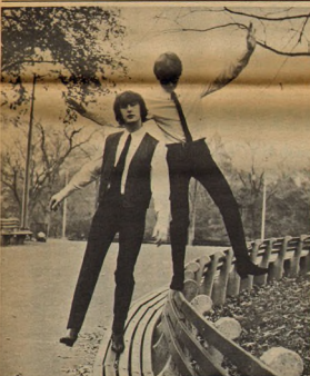
PETER and GORDON had the last laugh. Many in the music world predicted their popularity had ended, but their "True Love Ways" was an instant smash in both England and the U.S.