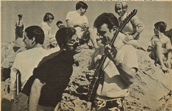
HOST DICK CLARK HAMS UP A SCENE WITH RAIDER PHILIP VOLK DURING FILMING

Other taping spots have included (or will include), Will Rogers Beach, Pacific Ocean Park, Pickwick, Griffith Park, the Hawaiian Islands, and Montreal, Canada.