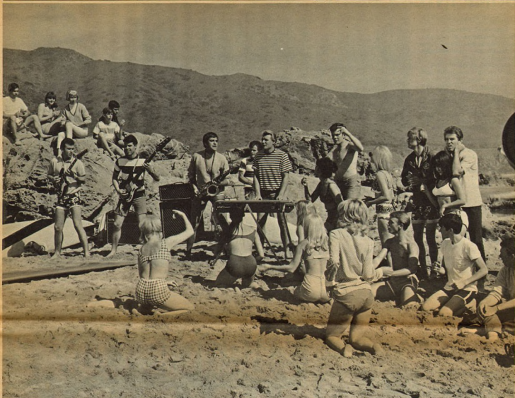
PAUL REVERE AND THE RAIDERS ENTERTAIN DURING BEACH BLAST ON NEW TV SHOW