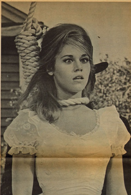
CAT (JANE FONDA) PREPARES TO BECOME A "SWINGER"

SHOWS DANCES FAN CLUB P.O. Box 12 Stanton, Calif. Tel. (714) 539-5880