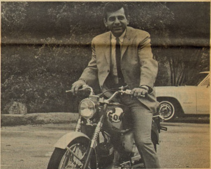
SPEED DEMON CASEY KASEM, MINUS BLACK LEATHER JACKET