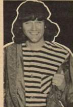
P. J. PROBY