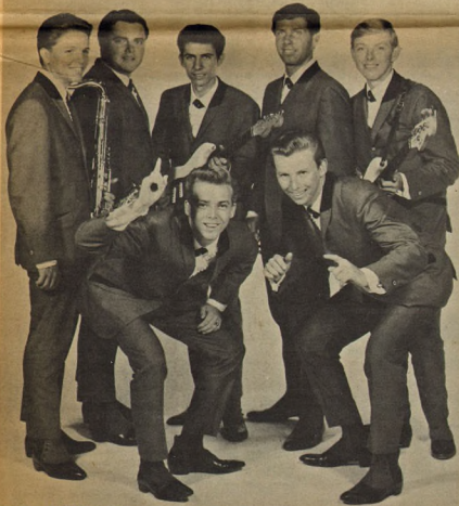
THESE ARE THE SPATS, and they're soon to be featured in a national magazine as an example of clean-cut American youths who have resisted the long-hair movement. They have appeared at Disneyland and on numerous television shows, and will be featured with Dove Clark Five at Pasadena Civic Auditorium July 10. The group from Garden Grove recently released a new record, "Billy the Blue Grasshopper."

On Thursday of last week, unmentioned, and unsung, James Marcus Smith, alias Jet Powers, otherwise known as P. J. Proby, self-styled god of popular music, slipped silently out of Los Angeles bound for London. The party was indeed over . . .