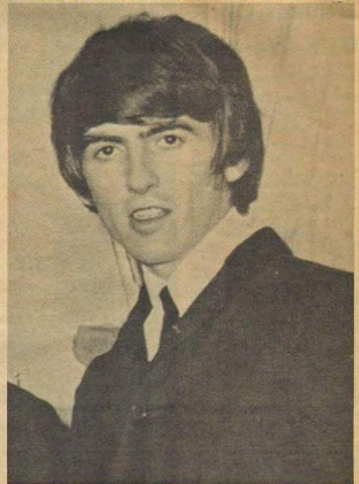
... GEORGE HARRISON

It's a welcome change to see a pop star (and such a popular one too) admit that he has a girlfriend and that they are thinking of marriage. Much too often such things are hidden from the fans. Why? Do they really think fans won't accept the fact that pop stars are human, that they fall in love, that