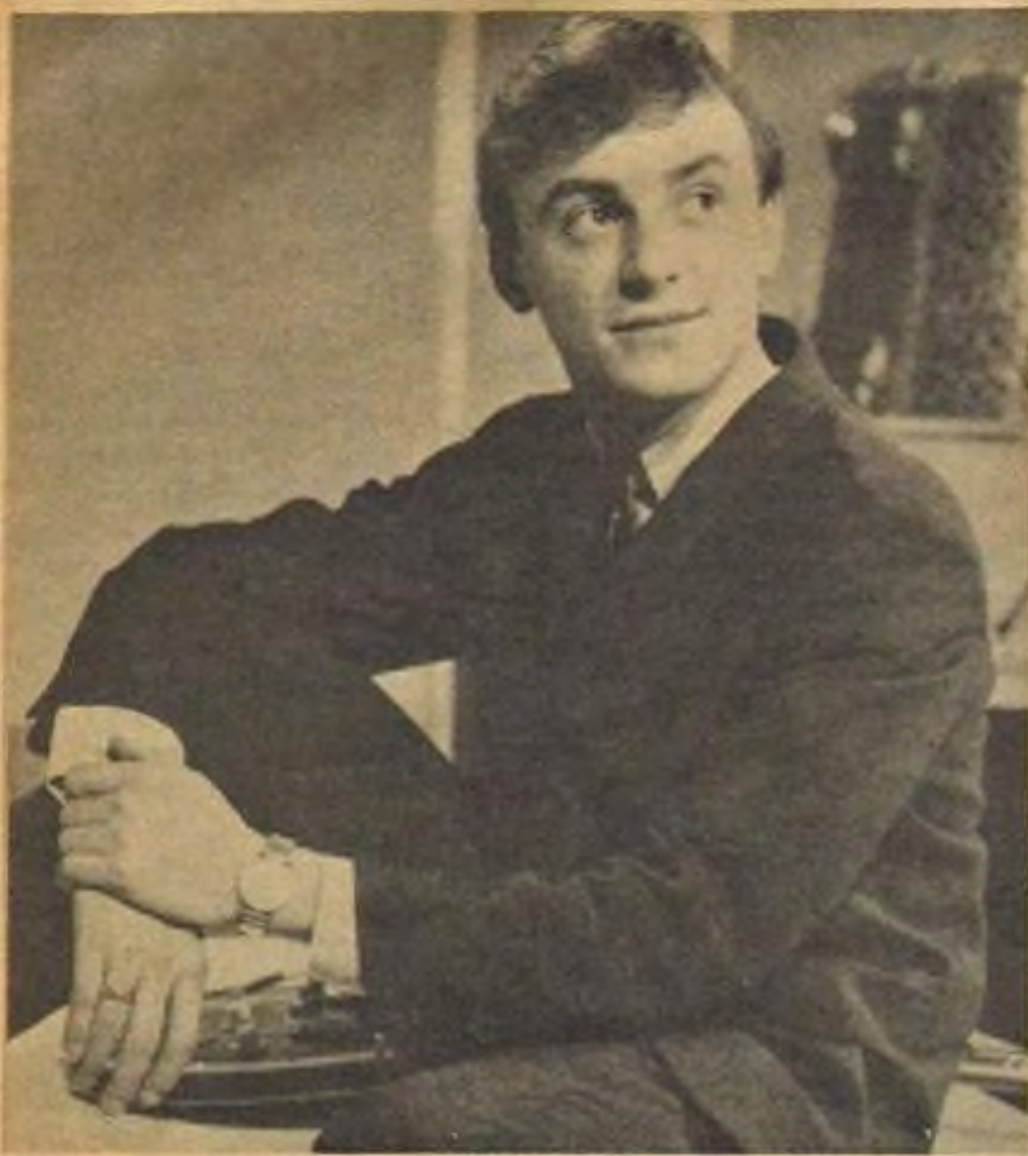
... GERRY MARSDEN