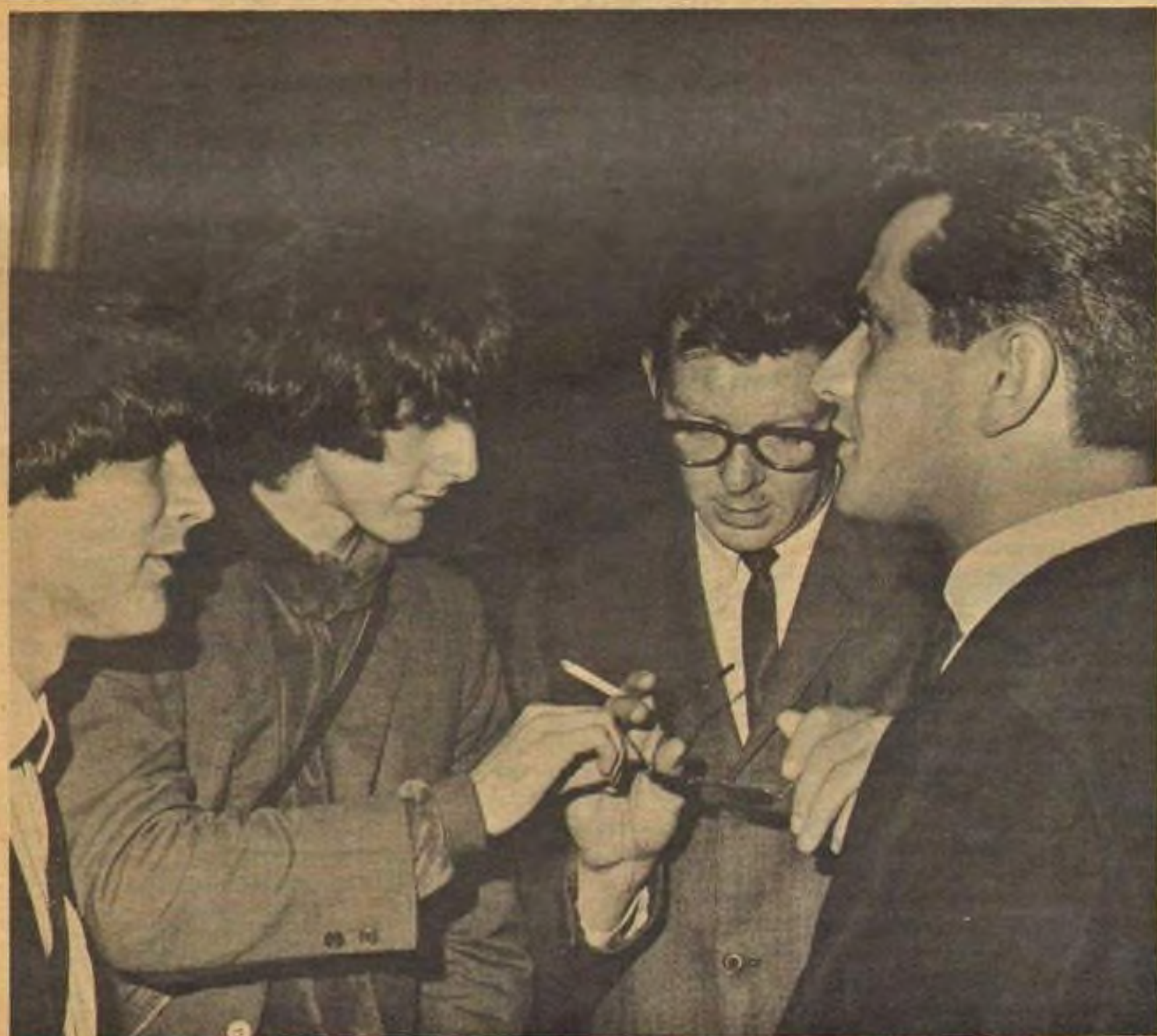
BACKSTAGE WITH THE BYRDS , KRLA's Charlie O'Donnell and Dave Hull examine the now-famous "Benjamin Franklin" eyeglasses worn by Jim McGuinn. That's Dave Crosby of the Byrds on the left. Casey Kasem has had a similar pair made and plans to wear them on "Shebang."