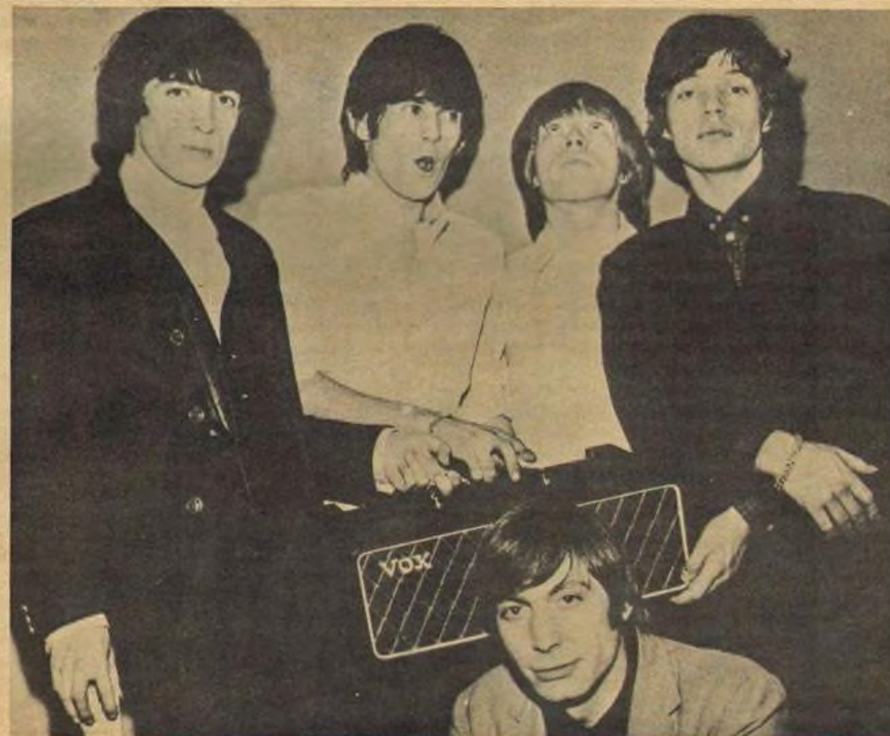
MOVIE CAMERAS WILL ROLL for the Rolling Stones. In addition to being among the world's most popular recording stars, it looks like they will soon become movies stars. It should be a gasser.

When their first full-length movie winds up filming, the Stones will embark on a four-week tour of Britain. And then in late October or early November, the Stones are coming State-side again! However, no dates