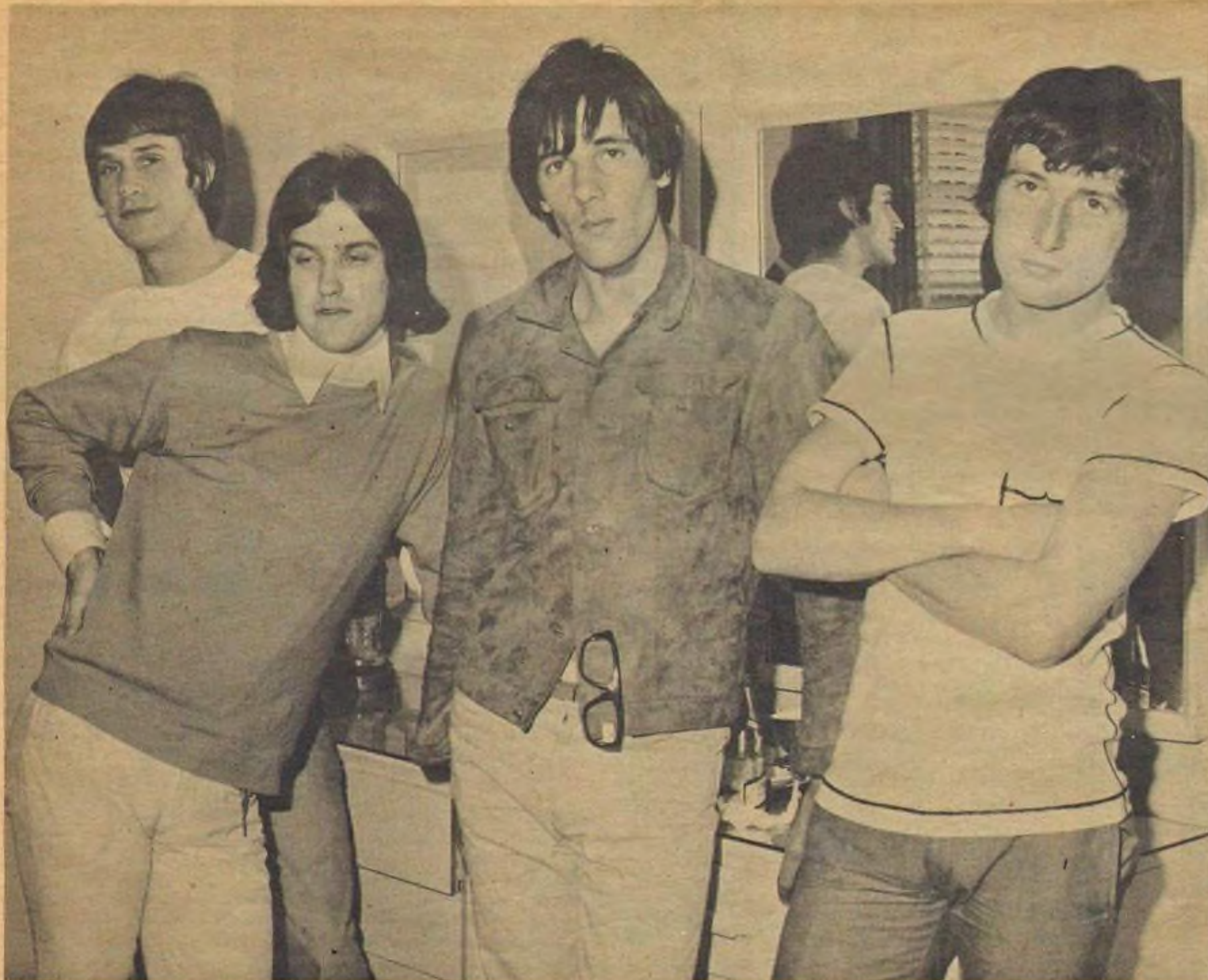
THE FOUR KINKS staring into the camera are (from left Ray Davies, Dave Davies, Mick Avory and Pete Quaife. The four took time out from their first afternoon in California to pose for the BEAT photographer.