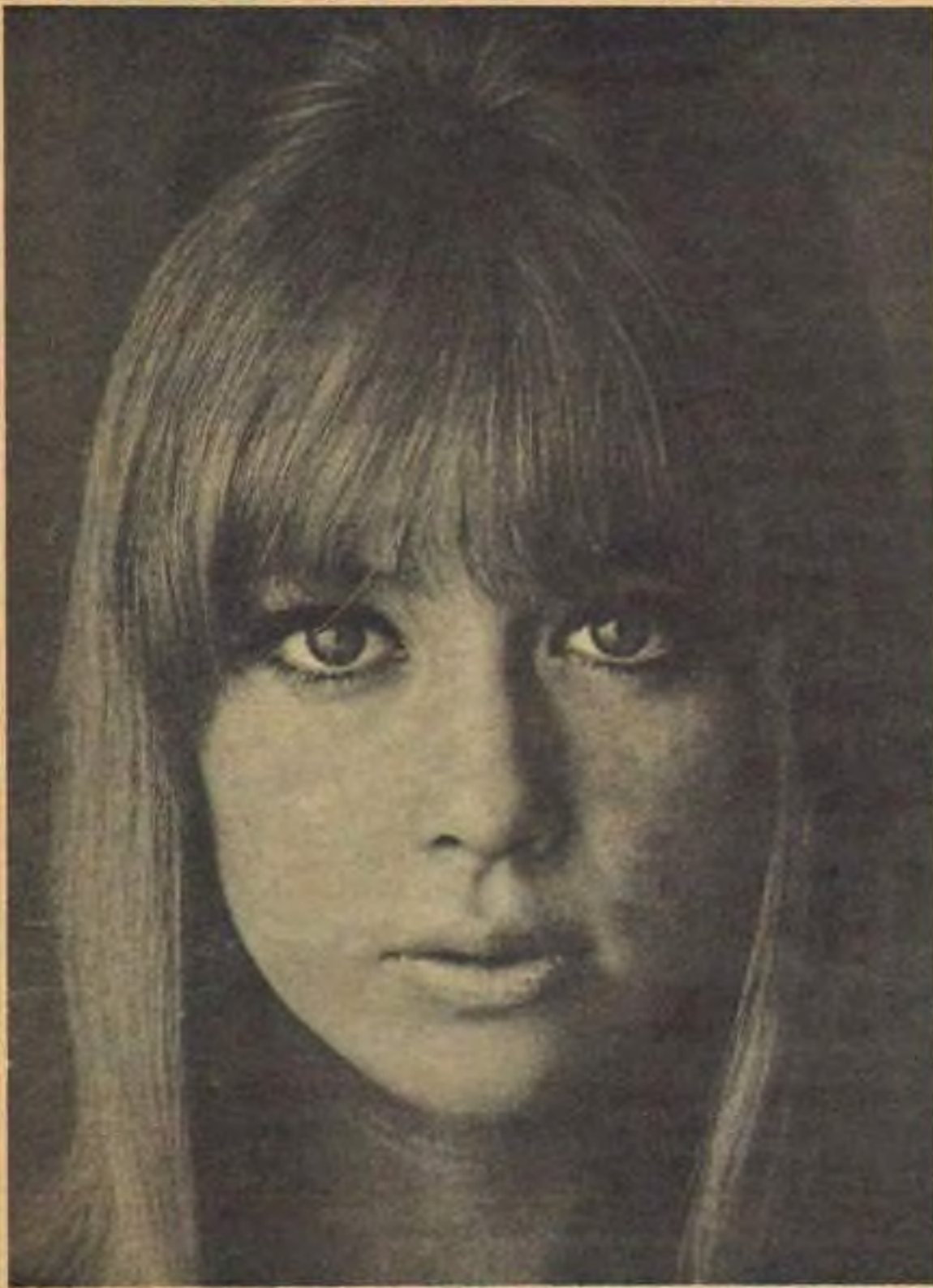
... PATTIE BOYD