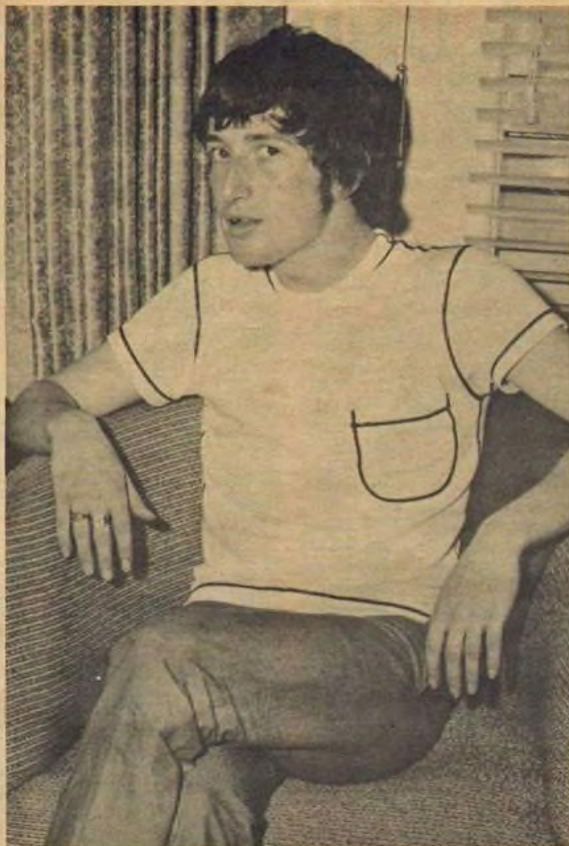
PETE QUAIFE gives the BEAT one of his famous "Kinky" looks. Pete, who plays the bass guitar, loves to go shooting. He is also fond of bow and arrows.

While in Los Angeles the group will do a show for Shindig, Shivarree and appear at Hollywood Bowl. Their appearances in California will include shows