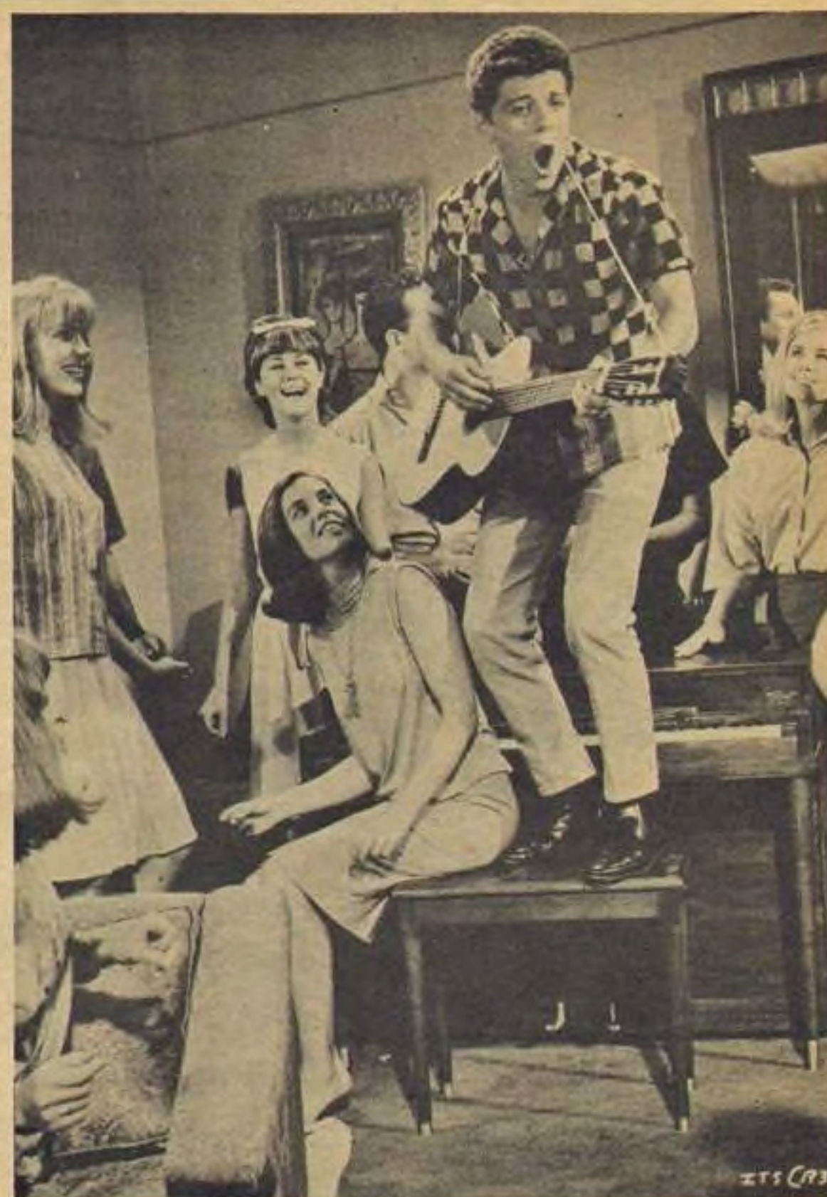
FRANKIE AVALON ENTERTAINS in a couple of scenes from the hilarious new movie, "I'll Take Sweden", co-starring Tuesday Weld and Bob Hope. At a party (above) he belts out one of the great new original songs introduced in the movie. Below, he prepares to do a watery finish to another number. In the film Frankie and Tuesday carry on an international love affair and discover some startling differences in the American and Swedish outlooks on marriage.

The American view of Sweden's morals provides much of the material for the funny lines in the story, but it is all done in excellent taste, and the kind of film that any family, and especially one with teen-agers, ought to go see. It's funny!