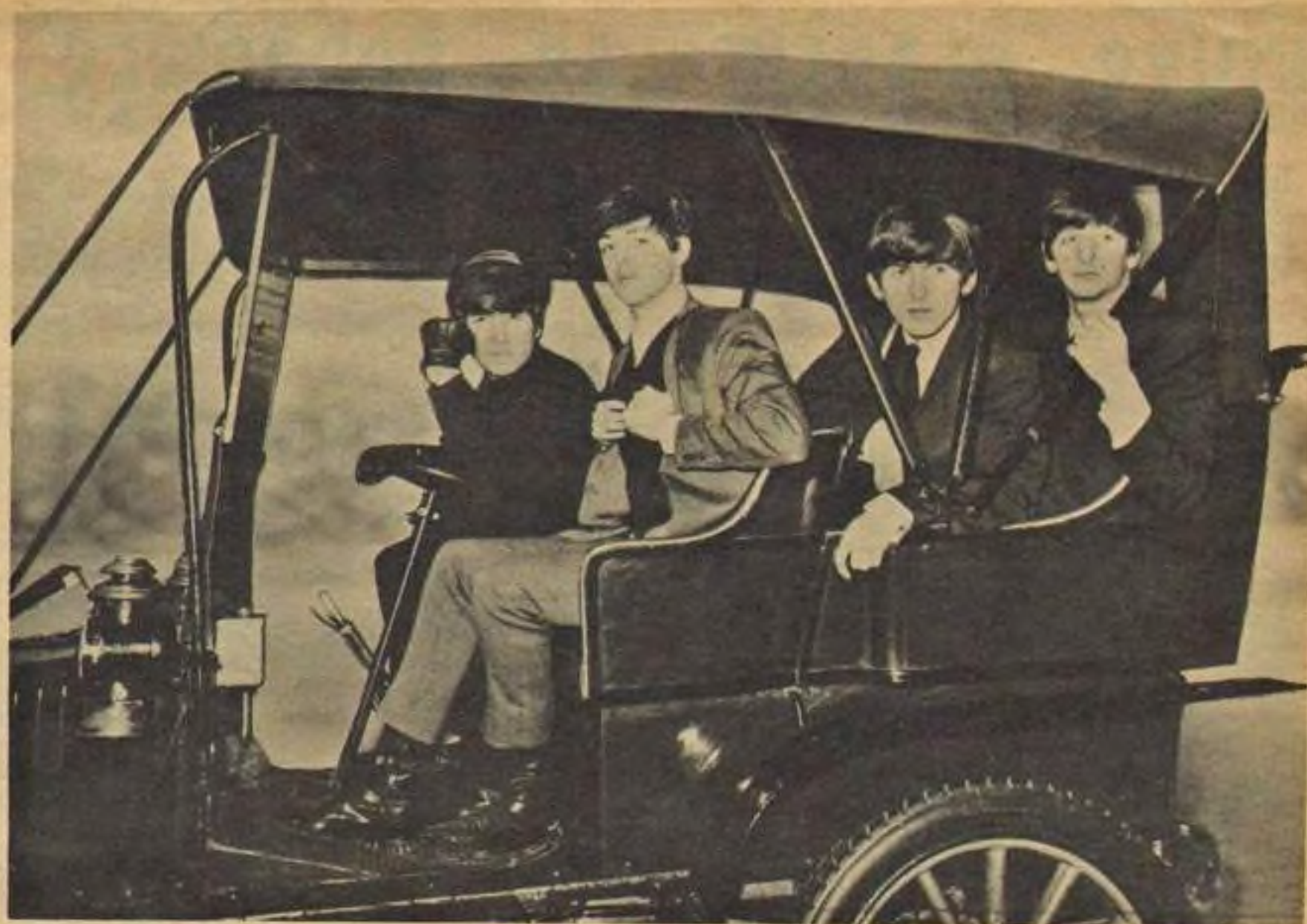
... STILL IN THE DRIVERS SEAT

It is your newspaper. And with your help we will continue to make it an even bigger and better newspaper.