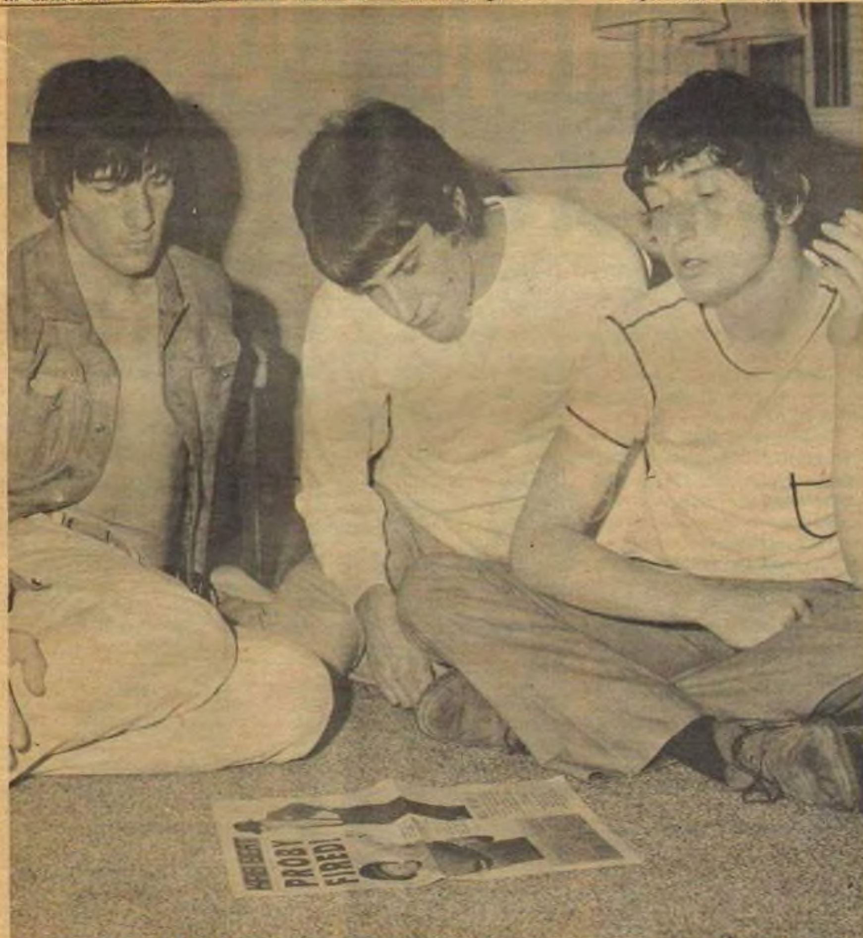
READING THE BEAT are (from left) Mick Avory, Ray Davies and Pete Quaife. They are in their Los Angeles hotel, where they will be staying when they are not running from show to show.

"The stuff I've done isn't as good as what I'm going to do," Pete predicted firmly.