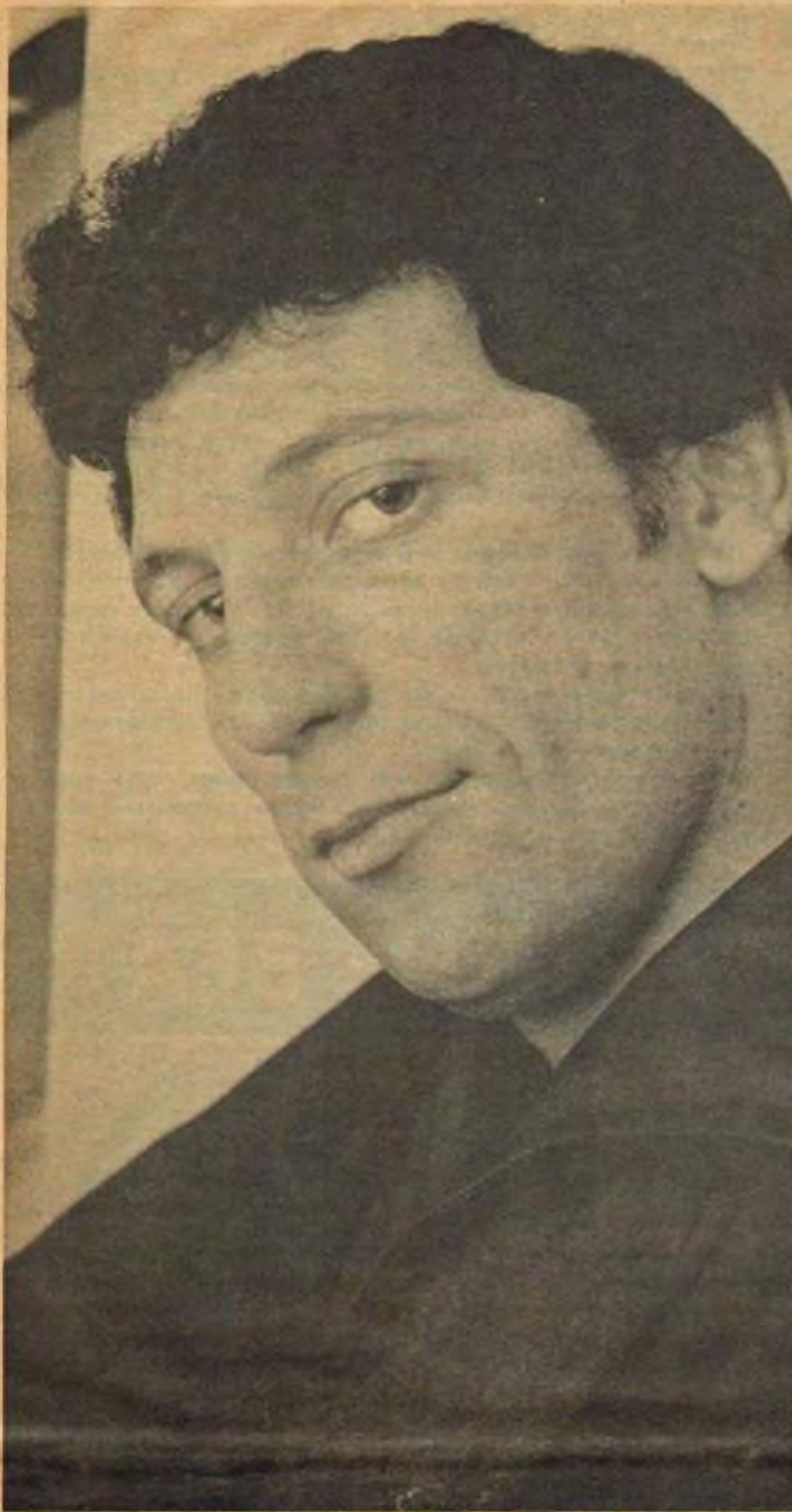
"ITS NOT UNUSUAL" to see the name of Tom Jones, England's greatest single export, on the top of the charts. His latest hit is "What's New Pussy Cat" from the movie of the same title.