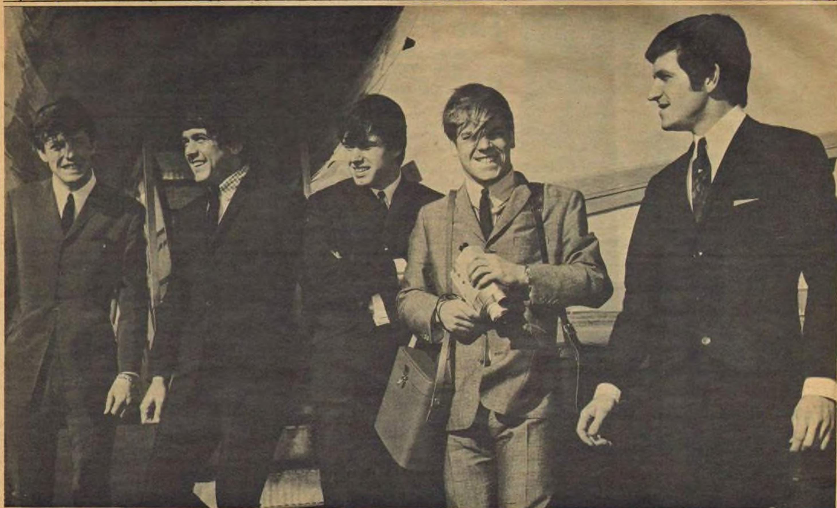
THE DAVE CLARK FIVE, DAPPER AND DASHING, ARRIVE AT WIND-SWEPT LOS ANGELES INTERNATIONAL AIRPORT. They're on a nationwide tour which includes several television shows, a performance at Melodyland Theatre (with Sonny & Cher) and other concert dates.