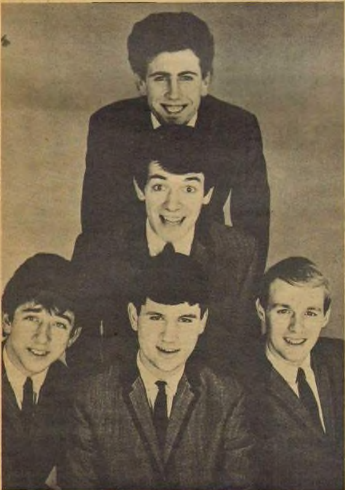
THE HOLLIES HAVE A HIT. The group from Manchester hit the top of the British charts last week with "I'm Alive." They're a clean-cut, talented fivesome, at home with both swinging ballads and rock.