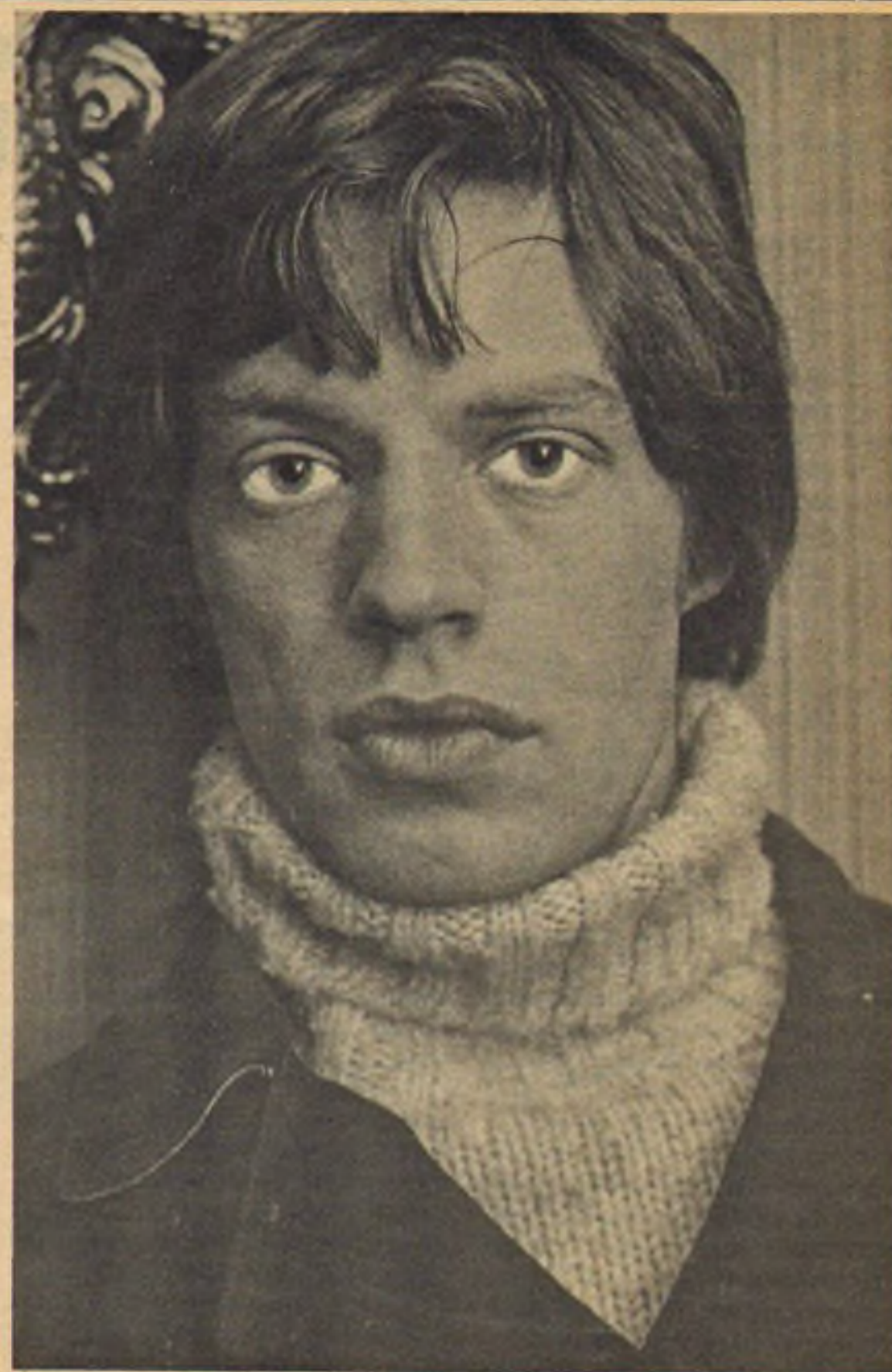
... MICK JAGGER

Brian began his school career at an establishment known as Dean Close Public School. Brian got away with a lot as far as his teachers were concerned because of that innocent look and kind of