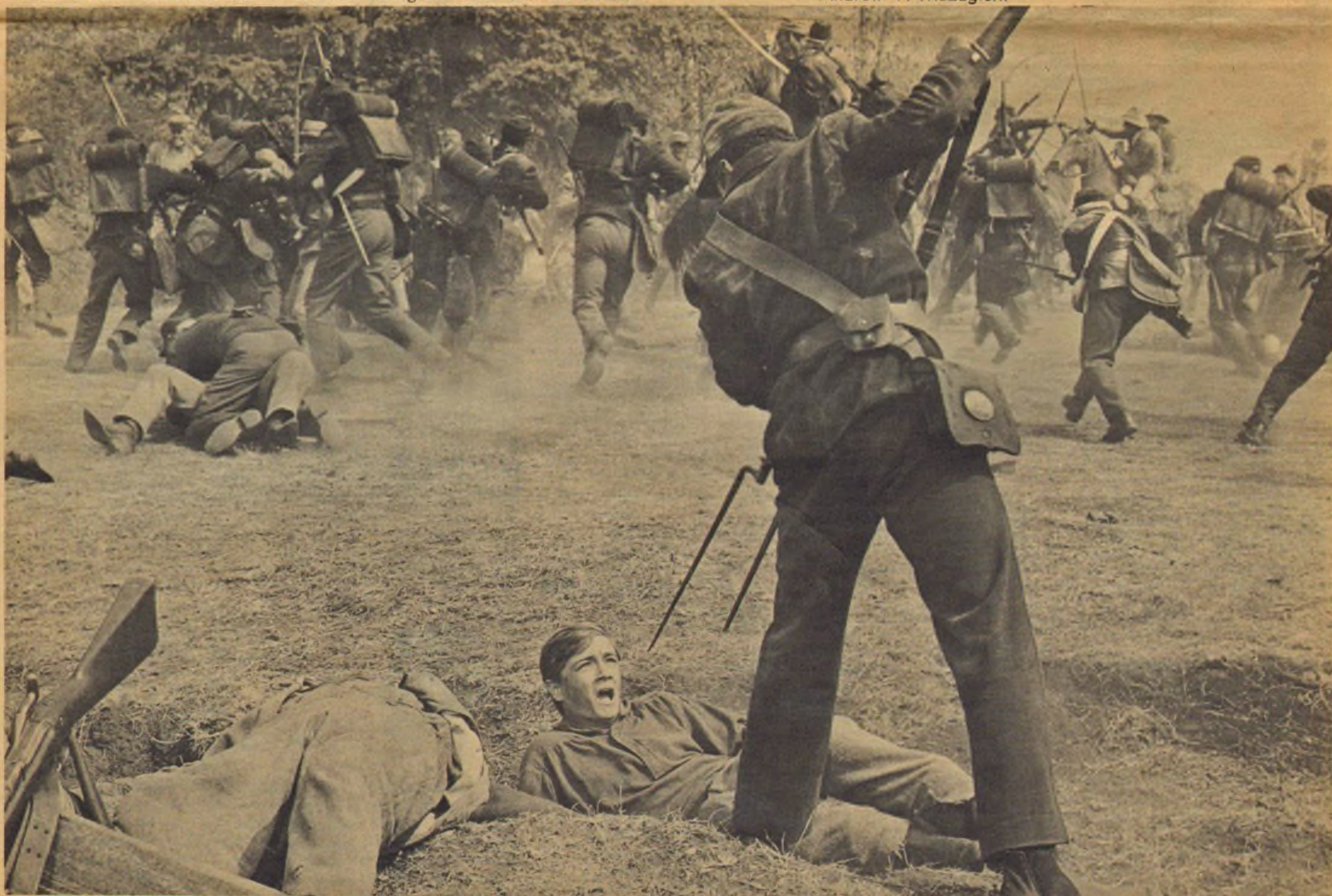
A POINTED MOMENT in the film occurs when the Yankee Army overruns the Southern Position and the young man stares death in the face. In spite of appearances, Shenandoah is a good family picture and all the girls should take along a dry handkerchief. (Did all Union soldiers wear Beatle boots?)