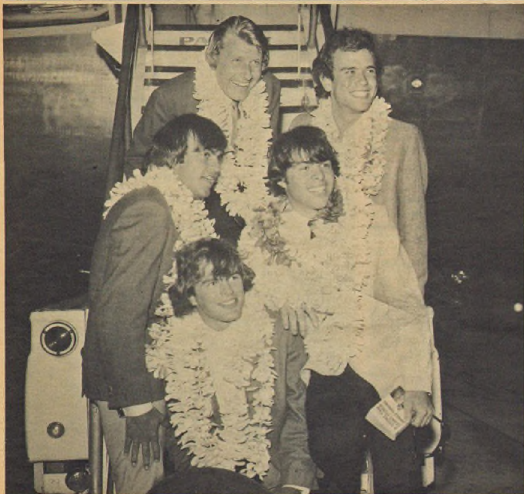
... THE RAIDERS