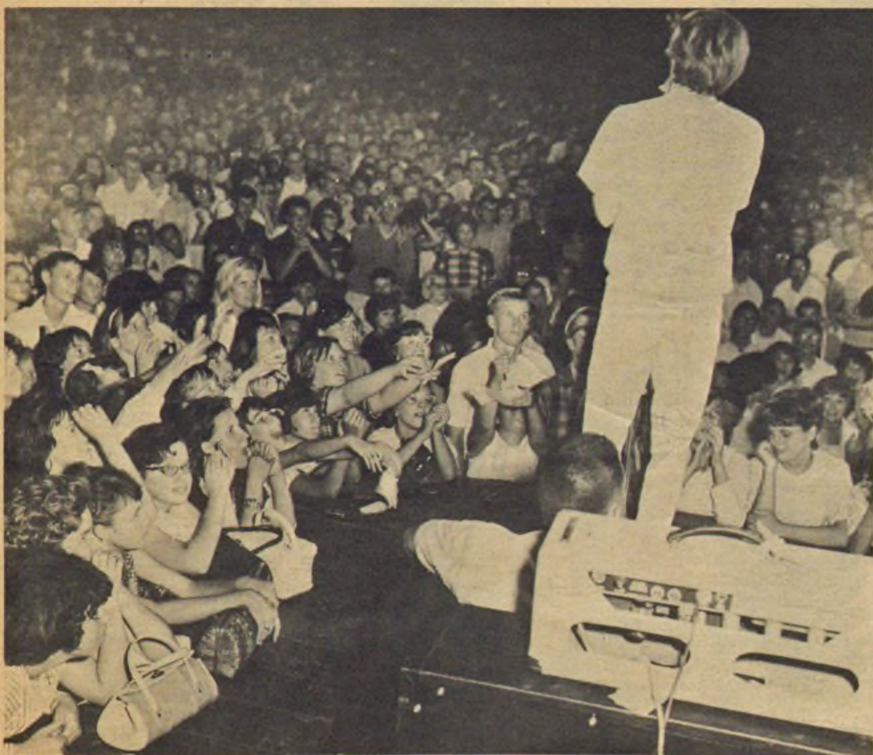
YES, ITS HERMAN doing a show with the Dick Clark Caravan of Stars. Herman and his Hermits made such a hit in the United States, they have come back for another tour.