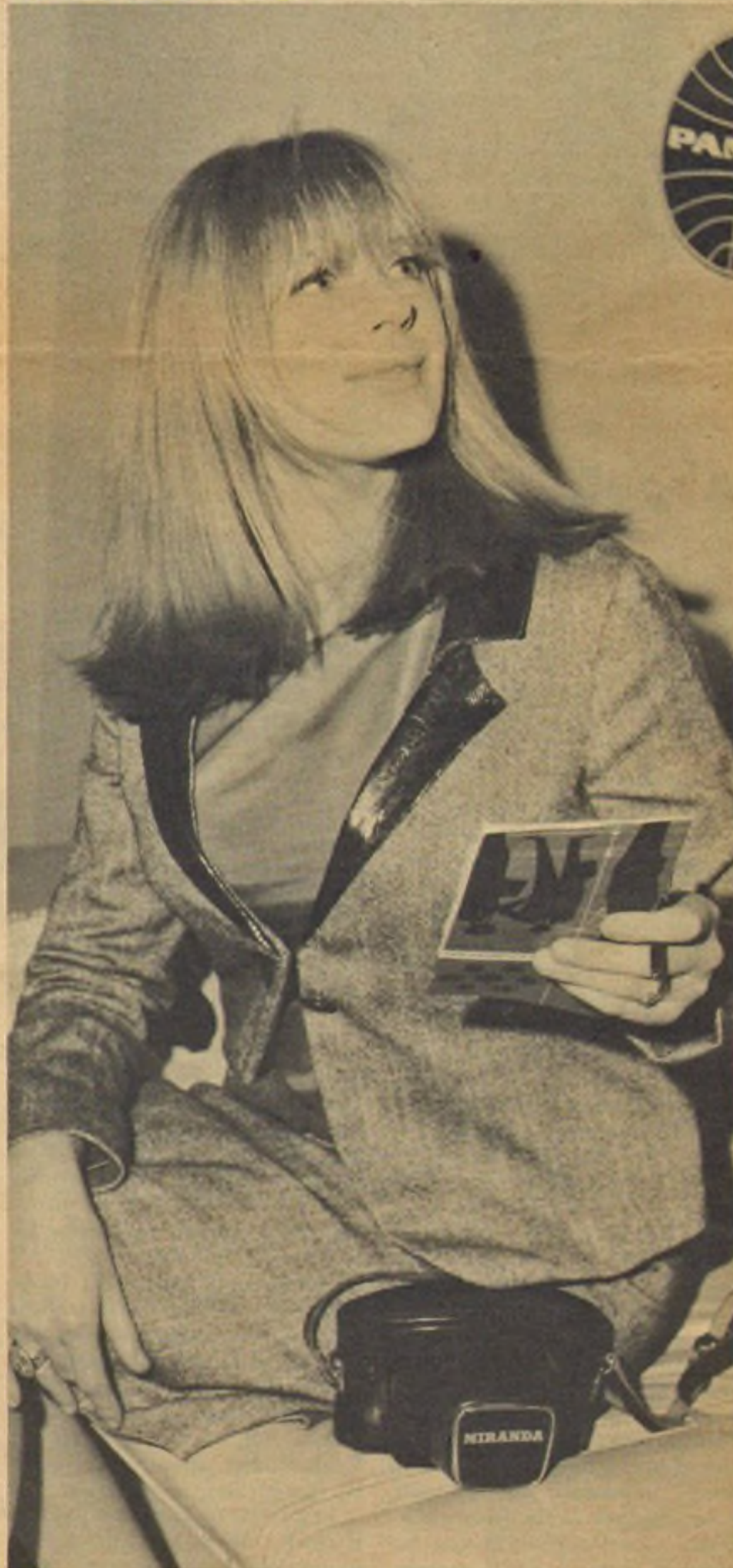
ARRIVING AT SUNNY CALIFORNIA, English recording star Marianne Faithfull removes her coat and pops on a pair of sunglasses. After all — when in California, do as the Californians do.