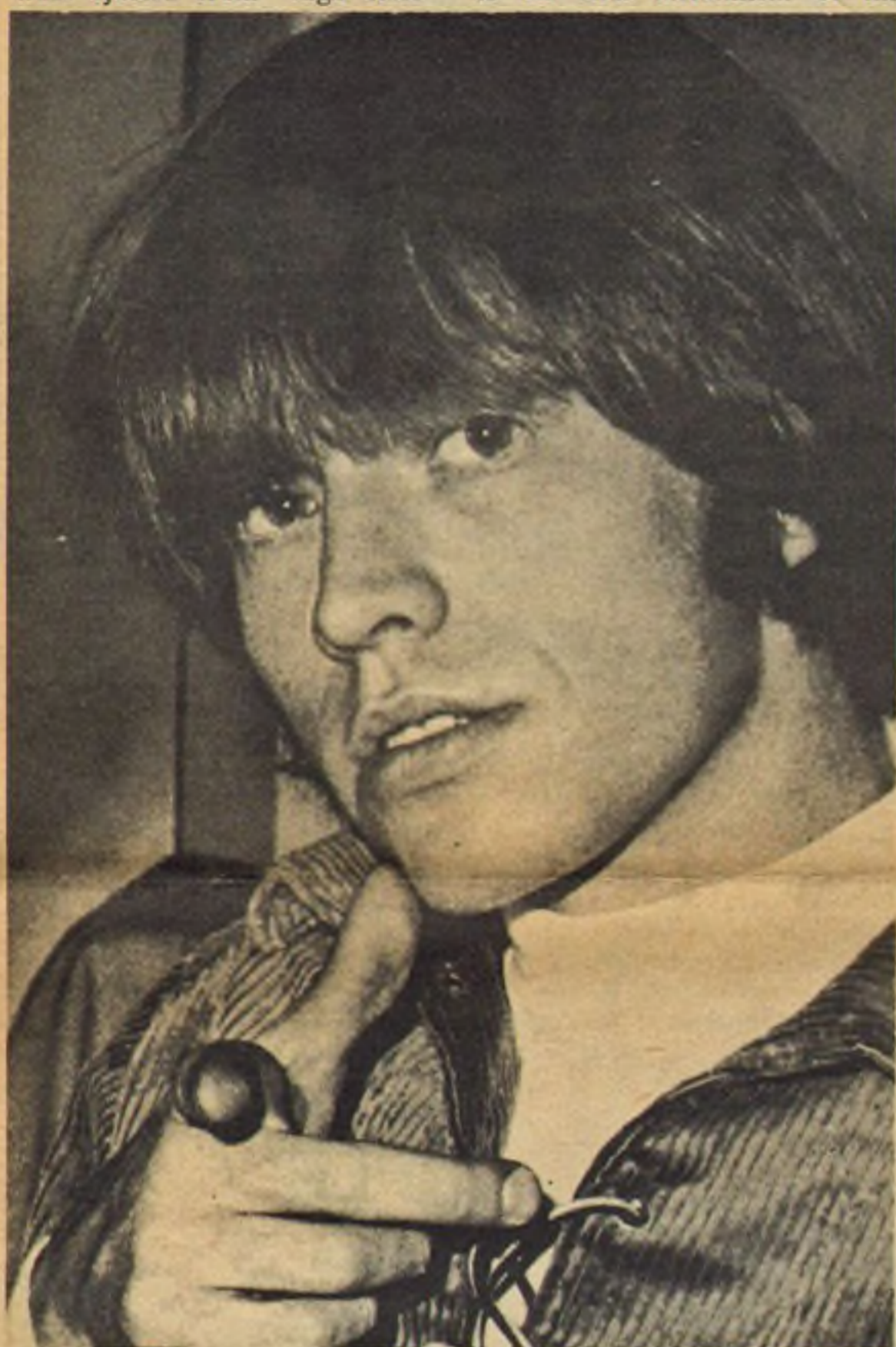
... BRIAN JONES

5. You know how it is when your boyfriend takes you to a movie starring your favorite. You sit there and shriek and he sits there and glares. This is because he thinks that he is sane and you are nuttier than a fruitcake. Well, next time you go to a movie starring his favorite, secretly nudge him with a large knitting needle until he roars loudly. Then glare at him in disgust. Perhaps he will get the point.