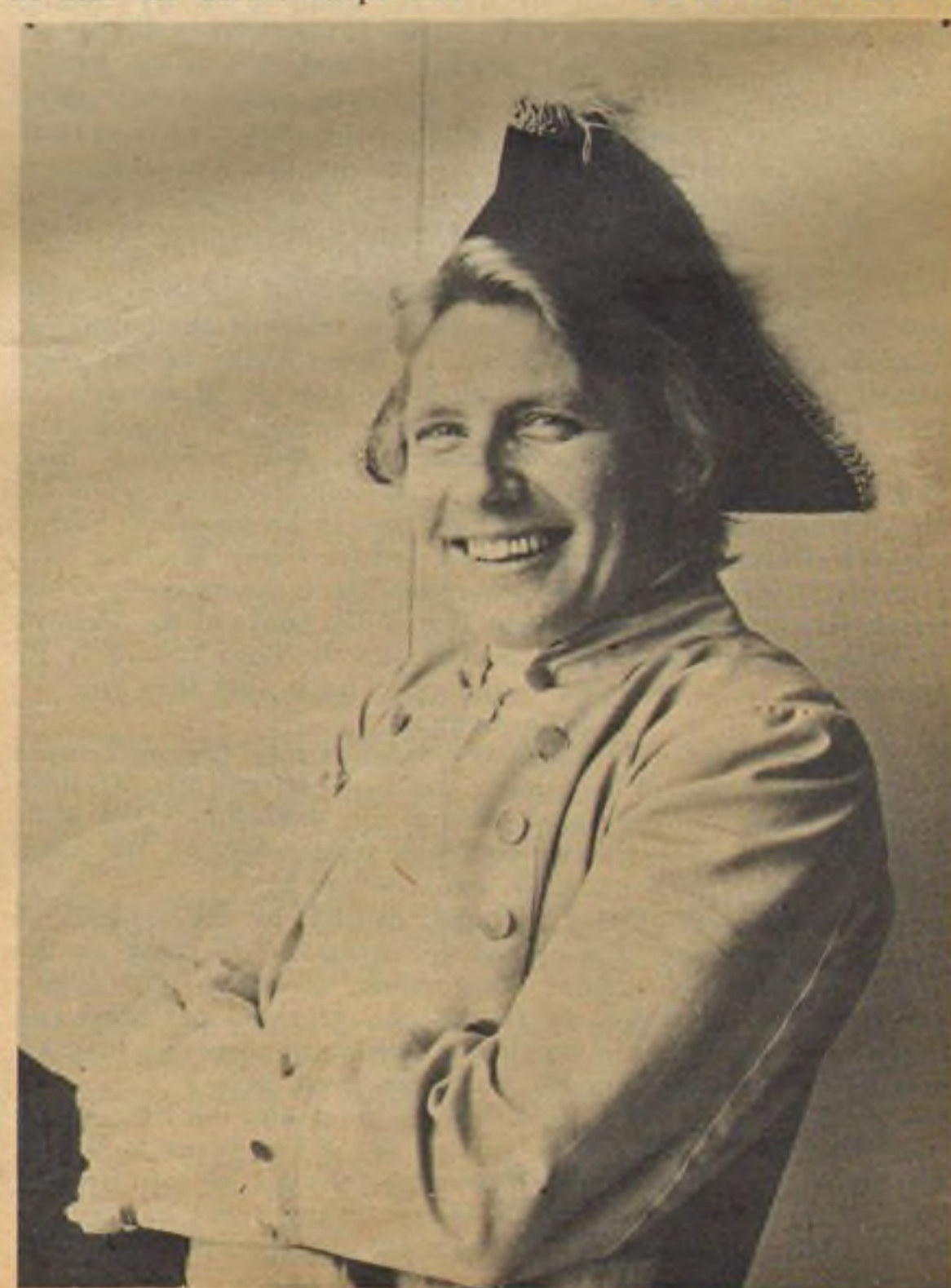
... PAUL REVERE

Since everything is still "just talk," only time will tell.