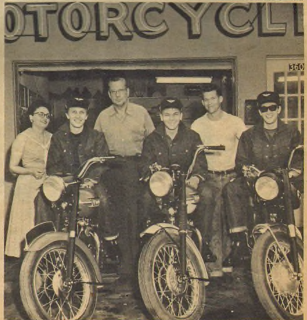
... ORIGINAL CRICKETS

Paul McCartney John Lennon George Harrison Ringo Starr