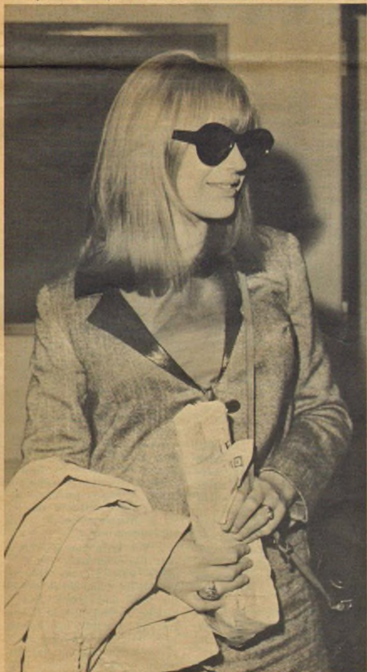
MARIANNE FAITHFULL, like any other tourist, brings her camera and sunglasses upon arriving in California. Direct from London, Miss Faithfull came to the U.S. via Pan American to do a Shindig Show.