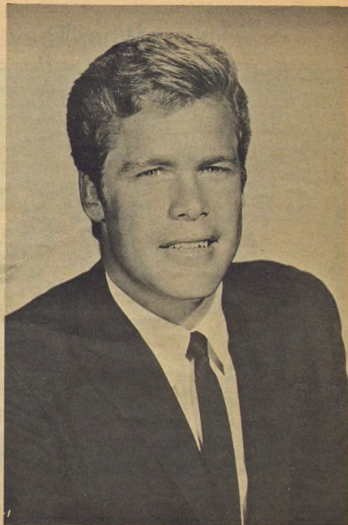
DOUG McCLURE , who has been seen in "Virginian" TV series, stars in this epic film along with James Stewart, Glenn Corbett, Patrick Wayne and Rosemary Forsyth. The Civil War drama was produced by Robert Arthur and directed by Andrew V. McLaglen.

That's a quick check list of the recommended features from the BEAT.