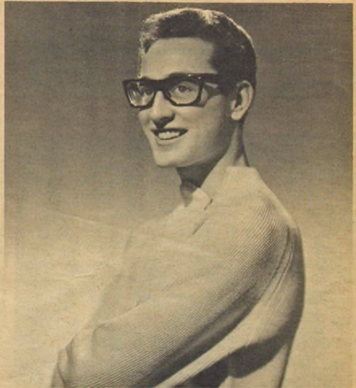
... BUDDY HOLLY

Now they will all be practicing singing in the shower.