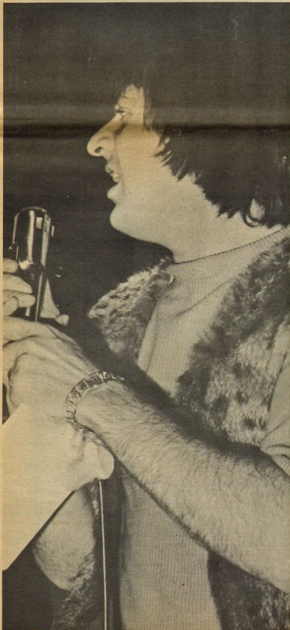
SONNY BONO — "NOT TIDY ENOUGH"