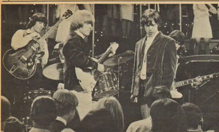
CAUGHT BETWEEN TAKES during a recent television taping, members of The Rolling Stones take time out to chat with some of the audience.