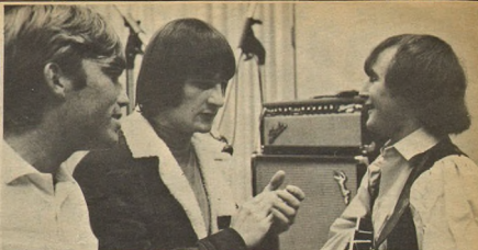
AS YOUNG A & R PRODUCER TERRY MELCHER (left) listens appreciatively, Byrds Gene Clark (center) and David Crosby monitor a "take" in the studio during the recording session recently of their trend-setting album for Columbia Records. The California group just returned from a smashing successful British tour, their first trip overseas.

RECUPERATING from a serious multiple leg fracture suffered in a Paramount Studio accident recently, Jan Berry (of the Jan & Dean partnership) stiffens an upper lip and wishfully makes like a mack dive into the pool at his Son Fernando Valley home. Careful, Jan — one slip and that plaster cast will send you down to Davy Jones.