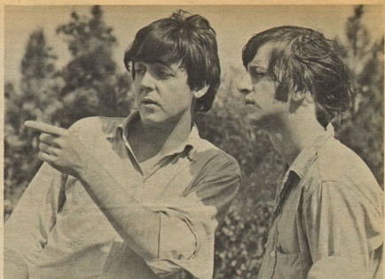
PAUL AND RINGO look like a couple of tourists as they catch their first sight of the California Pacific during their week-long visit here. While Southern Californians were seething with Beatlemania, the Beatles calmly basked in the sunshine at their Benedict Canyon retreat.

Yes the Bowl is accustomed to the world's great entertainers. But even so, this will go down as The Week That Was.