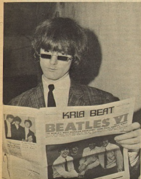
BYRDS' JIM MCGUINN