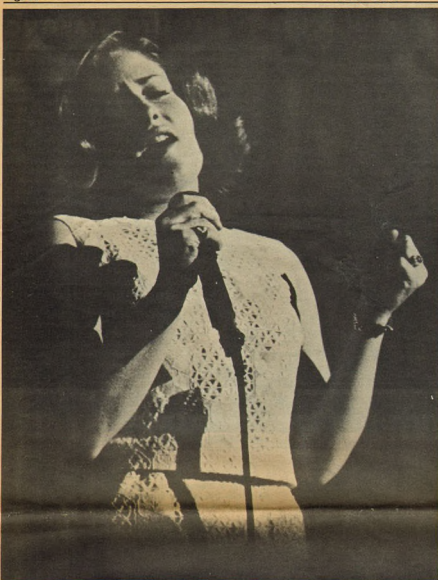
LESLIE GORE HAS A NEW IMAGE. The old one was fine, but the new one is like "Wow!" The "Sunshine, Lollipops and Rainbows" girl now includes a good selection of ballads along with her up-tempo teen material. Sporting a new hairdo and a polished stage presence, she will co-star with the Animals in a series of West Coast appearances this month.