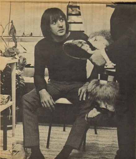
"BUT WHAT HAPPENED TO THE ESKIMO . . . ?"