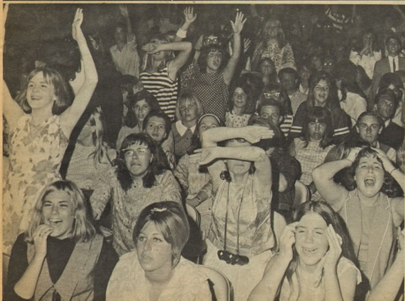
BEATLEMANIA IN ADVANCED STAGE. Shrieking, screaming, crying, laughing — all symptoms of the violent disease which caused pandemonium at Hollywood Bowl during KRLA's two Beatle performances.