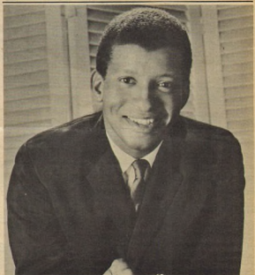
MEL CARTER'S "Hold Me, Thrill Me, Kiss Me" has been one of the top songs of the summer. You'll be hearing it played for years to come as a "Golden Record" selection, bringing back memories of this summer which is drawing to a close. It has also firmly established Mel as one of the world's top vocalists.