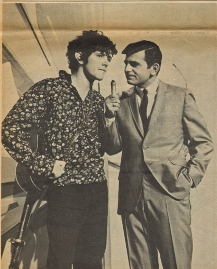
DONOVAN TELLS CASEY KASEM and a "Shesbang" audience how he writes and records such hits as "Catch the Wind" and "Colours." But the popular English star won't say where he got the shirt.