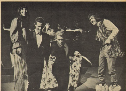
CHER in her "WOTCHAMACALLIT" and Sonny in his animal skin tails and out-of-this world boots look on in mirth as the dressed-up Righteous Brothers do their stuff on 'Shindig.'

Sigh!!! Just fine, thank you! Are you ready to spend some