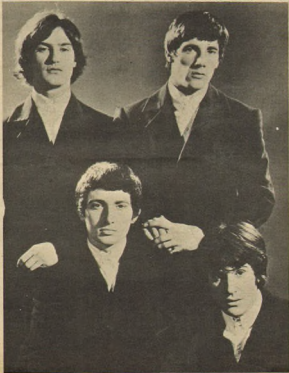
THE KINKS — DAVE, PETER, MICK AND RAY.