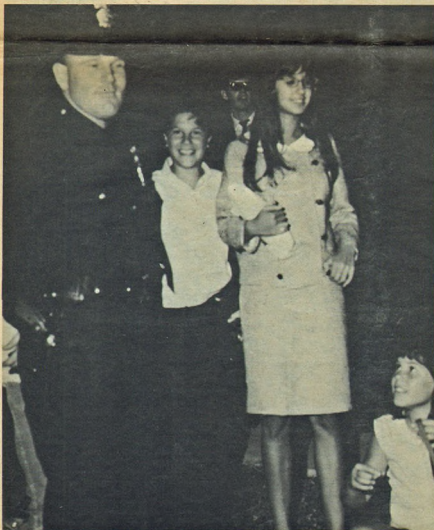
Elated fans and amused policeman await arrival of the boys.