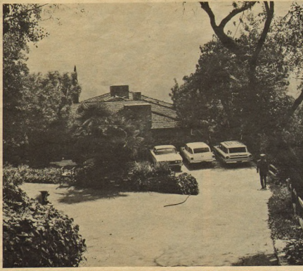
THE BEATLES HIDEAWAY during their vacation-cum-work in Southern California is quiet once more now that the Fab Four have departed our scene. High above Hollywood the rented aerie was under police protection at all times during the Beatles' stay (note guard in photo).

Be on the lookout for these boys—with Epstein's protective wing about them they're bound to go.