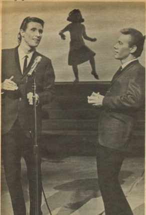
THE RIGHTEOUS BROTHERS always bring down the house on Shindig . They still appear frequently, even though filming their own movie (a James Bond type, of all things) and running their new record and publishing firm. Shindig gave Bill and Bob their first national TV exposure, bringing stardom.