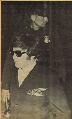
Bored, John Lennon leaves alone — and before 9:30 p.m., too.