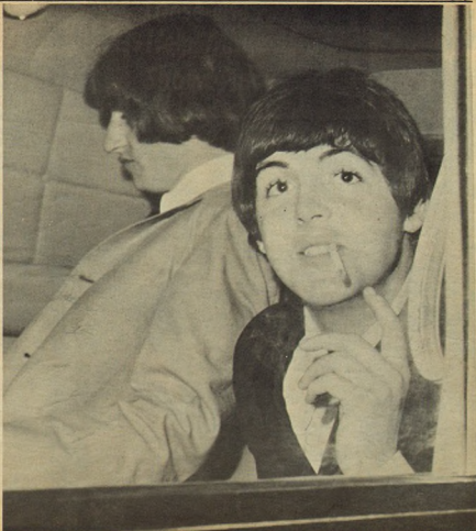
In car, hard on John's heels, a dejected Ringo and blase Paul take off too.