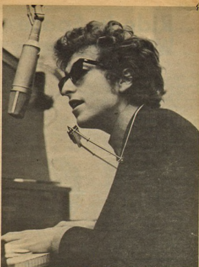
Bob Dylan—Protests Profitable