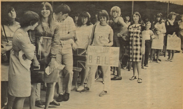
WAITING FOR 'HELP' — "WE LOVE YOU, BEATLES"