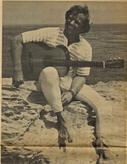
... Barry McGuire