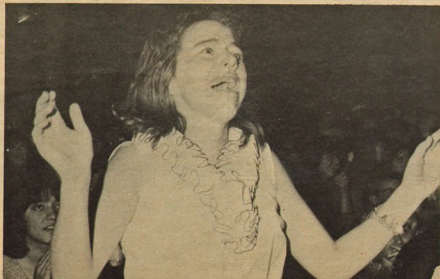
BEAT Photo by C. Boyd

"LOOK OUT, RINGO!" An Alarmed Beatle fan screams a warning as pursuers close in on Ringo in "Help." Luckily, our heroes foil the plot.