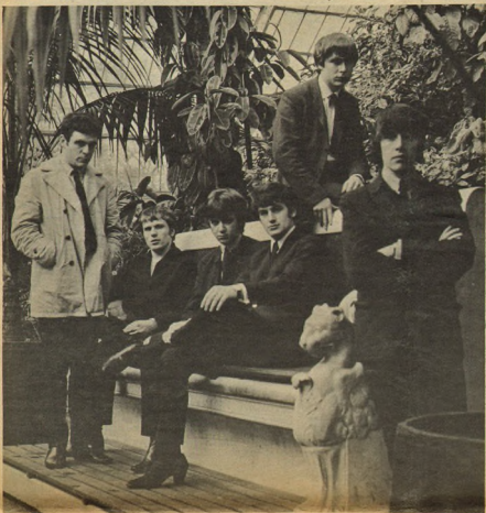
The Clayton Squares

Undoubtedly, the number one group in Liverpool right now is a group called The Clayton Squares, or the "Squares," as they are known to their fans. Even now they are causing a good deal of commotion all around Liverpool, and people are tipping them to become very big stars indeed.