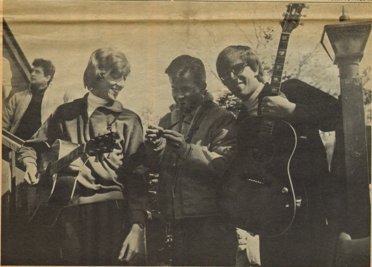
... TAPING "WHERE THE ACTION IS" WITH CHAD (L.) AND JEREMY (R.)