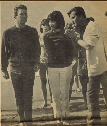
... DICK, DEEDEE AND DICK (CLARK) ON BEACH

I think I've discovered a brand new way to solve a very old problem. When you panic every time a boy would ask me out to a restaurant, even if it was only a hamburger place, for fear I'd