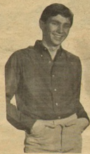
... Gene Pitney

Who knows—Gene just might have himself a double country number one record. And it won't be the first time either!