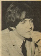
... Paul McCartney

FREDDIE CANNON found inspiration for his latest and fast-rising hit in a TV show title — Dick Clark's Where the Action Is . Now Freddie's got the action!