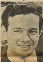
... Brian Epstein

Attention Donovan fans—your boy's returning Stateside for a November 5 appearance at Carnegie Hall!