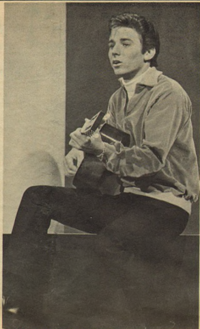
HANDSOME BOBBY SHERMAN , originally discovered at a party thrown by Sal Mineo, is one of the most popular Shindig regulars. In his spare time Bobby runs his own recording studio, produces film shorts and plays eight musical instruments.