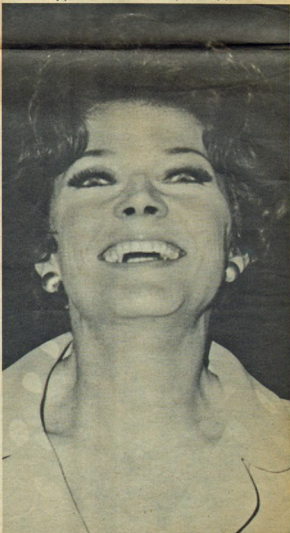
Glamorous singer-actress Polly Bergen arrives at the party

With the press barred, how then did The BEAT obtain these exclusive photos? Easy. BEAT photographer Chuck Boyd, intrepid and resourceful, merely disguised himself as a punch bowl. He returned empty, of course, but certainly not empty-handed.