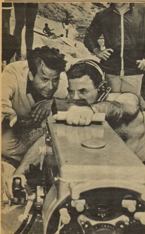
... Behind Camera, Mussed Hair