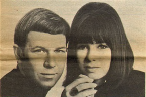
DICK AND DEEDEE—STILL ONE OF THE WORLD'S FAVORITE DUOS

SEND BEAT GIFT SUBSCRIPTIONS TO YOUR FRIENDS FOR CHRISTMAS