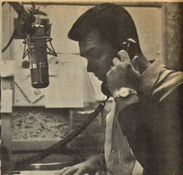
BOB EUBANKS takes a nightly Teentopper call.