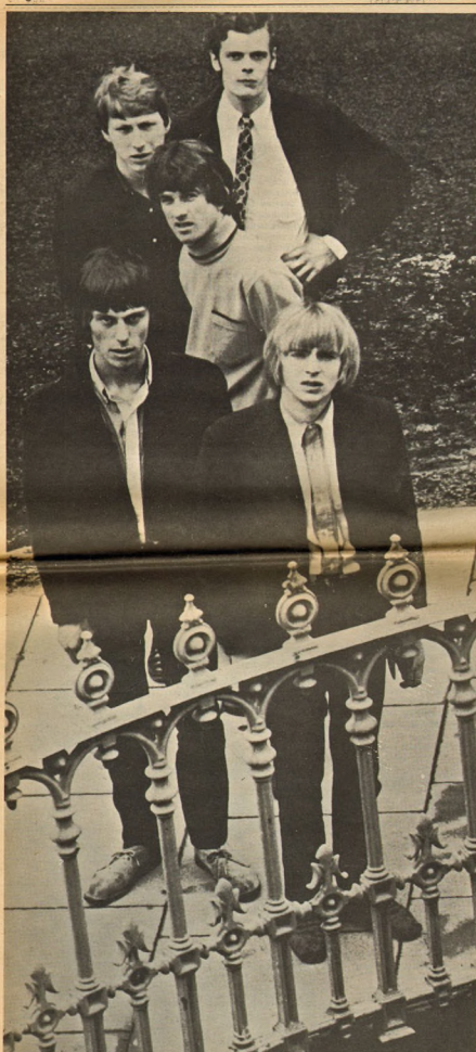
THE YARDBIRDS have a world-wide hit with "I'm A Man." But they've really started something with the flip side, "Still I'm Sad." It apparently has now inspired the arranging of the Beatle hits into Baroque ballads.