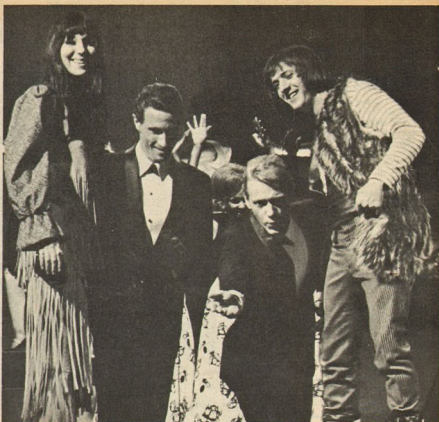
FRIENDLY COMPETITORS—SONNY AND CHER, RIGHTEOUS BROTHERS AMONG TOP DUOS OF 1965