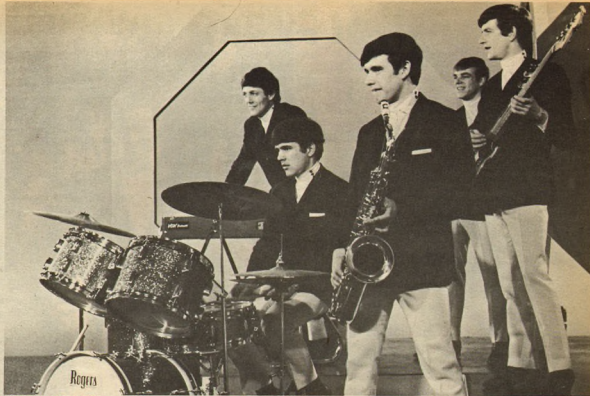
THE DAVE CLARK FIVE, completing a successful tour of the U.S., hit a new high on popularity. They have a new hit, "Over and Over."

In making the announcement he gave no date or other details of the tour, which presumably will be in South Viet Nam.