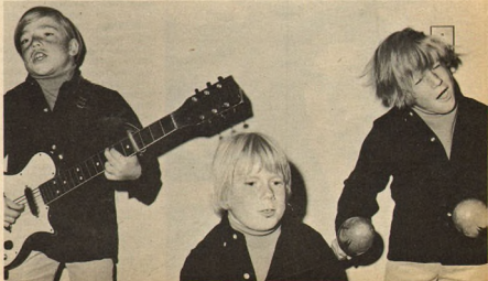
THESE ARE THE BANTAMS. They may become the answer to the Beatles for America's lollipop set.