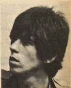
... KEITH RICHARD