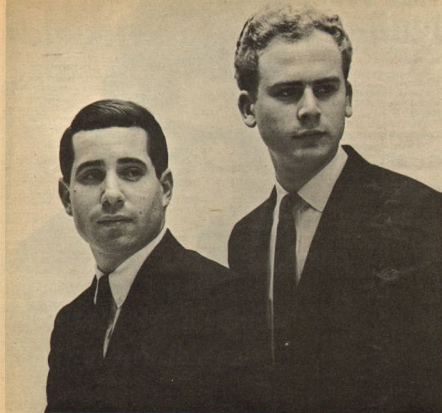
SIMON AND GARFUNKLE , New York City folk singers, have added a strange title to the hit charts, "Sounds of Silence." They've been singing together since high school days with Paul (right) doing all their composing. Paul and Art have also recorded an album, "Wednesday Morning, 3 a.m.," and are due here soon.

If you have a question you'd like answered or a hint you'd like to share, drop a line to Tips To Teens , c/o THE BEAT .