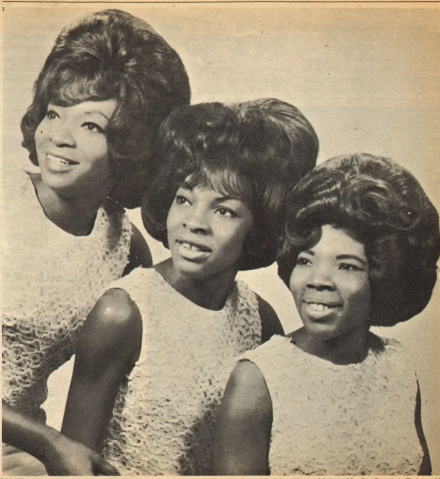
MARTHA AND THE VANDELLAS appear to have another nationwide hit, "Love Makes Me Do Foolish Things."

Send your answers to me at 17 Heydean Road, Allerton, Liverpool 18, England.