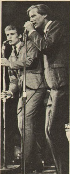
SURF KINGS JAN AND DEAN

The BEAT is published weekly for KRLA listeners by BEAT Publications, Inc., 6290 Sunset Blvd., Suite 304, Hollywood, California 90028. U.S. bureau in Hollywood; San Francisco, New York, Chicago and Nashville; overseas correspondents in London, Liverpool and Manchester, England. Single price, 15 cents. Subscription prices: U.S. and possessions, $3 per year; Canada and foreign rates, $9 per year. Application to mail or second-class postage rates is pending at Los Angeles, California.