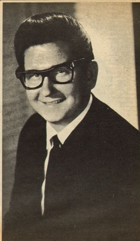
... ROY ORBISON takes a look into the future.

This adds another feather to the Beatles' cap. It isn't everyone who can write smash rock and roll hits that can be arranged in baroque fashion.