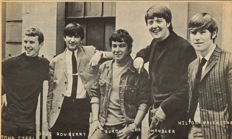
THE ANIMALS are celebrating another big year. "We Gotta Get Out of This Place" re-established them as one of the world's top vocal groups. Their latest is "It's My Life."