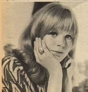
... MARIANNE FAITHFULL