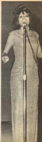
BRENDA HOLLOWAY She's found "That Lovin' Feelin'."