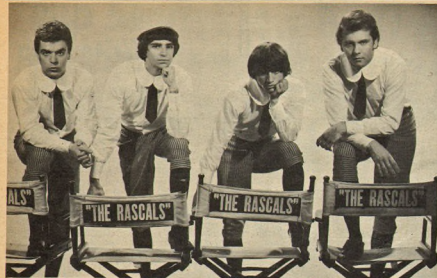
THE RASCALS have one heck of a gimmick, don't they? They appear complete with knickers. Buster Brown collars, short ties and caps. The group recently broke records at New York's Phone Booth Club (which incidentally, has no phones) like they were going out of style. Seen applauding in the audience opening night—the Stones, Bob Dylan, Herman's Hermits, the Lovin' Spoonful, Barry McGuire and Lesley Gore. Looks like the Rascals did themselves proud.