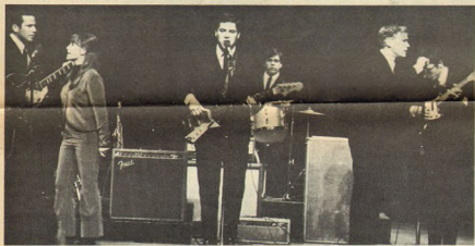
THE DEEP SIX — THEY CAME UP WITH INTERESTING GROUP VERSION OF "EVE OF DESTRUCTION."