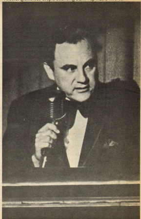
BEAT NO RECORD AWARDS FOR JOSE, BUT BILL DANA WINNER AS M.C.