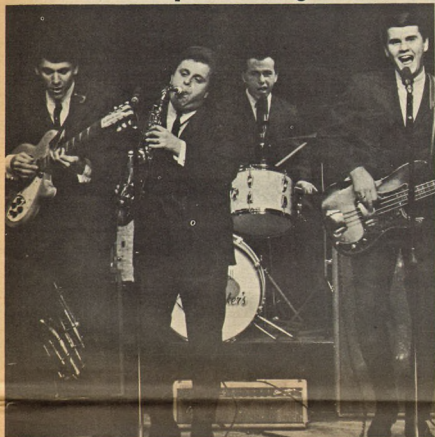
THE KNICKERBOCKERS — THEY AMAZED EVERYONE WITH PERFECT MIMICRY OF BEATLES IN "HELP."