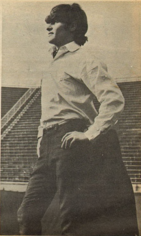
PETE BEST stands solemnly contemplating what will happen now that he has won the opener in his libel suit against the Beatles.

In the meantime, Pete has released "Boys." Yes, the same "Boys" which the Beatles recently released as a single and as hurriedly withdrawn from the market. Rather interesting, isn't it?