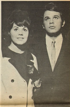
HANDSOME LOU CHRISTIE AND BEAUTIFUL LINDA SCOTT Another glamorous couple attending BEAT Pop Music Awards.