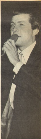
JERRY NAYLOR Roger Miller's: "King of the Road"