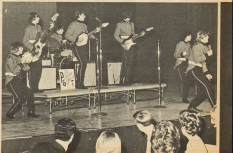
THE PALACE GUARD, REGULARS AT THE HULLABALOO, LIVEN THINGS UP DURING AWARDS SHOW. HER