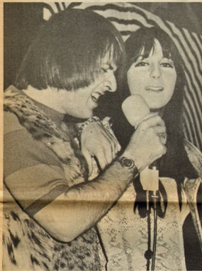
BEAT Photo Chuck Boyd

SONNY & CHER — TOP DUO PLUS SOLO VOCAL HONORS FOR EACH.