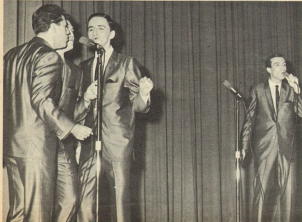
THE VOGUES — OUTSTANDING MEDLEY PROVED THEY'RE AS GOOD IN PERSON AS ON RECORDS.