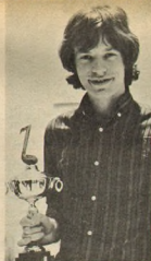
BEAT Photo Chuck Boyd

BEATLES — SENT WIRE THANKING BEAT, FANS FOR THREE AWARDS.