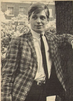
GEORGE FAME rests up after his stint at The Cavern. He hasn't done much here in the U.S. since his smash, "Yeah, Yeah," but in England he swings.

How about the Chad and Jeremy Show, fellows? That's always a good start.