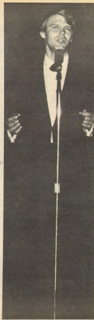
GLEN CAMPBELL Fabulous "Crying in the Chapel"