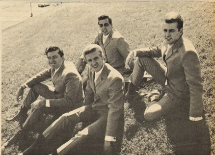
... THE STATLER BROTHERS

Looks like the Statler Brothers no longer have time for counting flowers on the wall or playing solitaire 'til dawn.