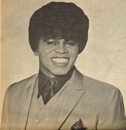
FOR JAMES BROWN , commercial success is no stranger. He has long been recognized as one of the top rhythm-and-blues artists. But 1965 will probably go down as his most satisfying year — the year he also became universally acclaimed as a pop artist. Another James Brown record, "I Got You," has made it to the top.