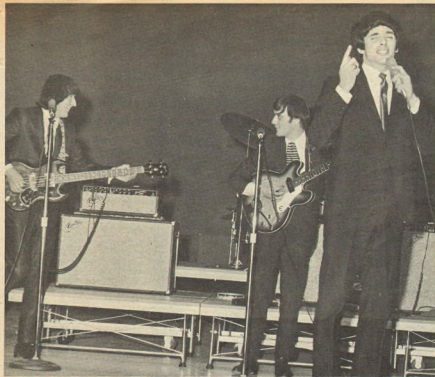
BEAU BRUMMELS — NAMED BEST NEW GROUP — DOING BYRDS' BIG HIT, "MR. TAMBOURINE MAN."