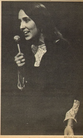
BEAT

Recently, this now former student, Bob Dylan, earned $26,038 for a one night stand in the same city. In a 9,000 seat auditorium there were only 232 seats unsold. Bob, "You're coming up in the world