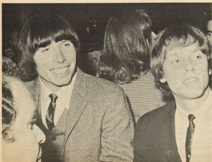
BEAT Photo Robert Green THE BEES JOIN 1,000 OTHER ARTISTS AND RECORD COMPANY PERSONNEL AT BEAT POP AWARDS.