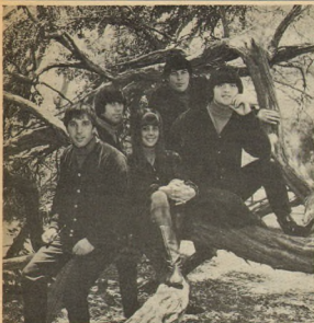
... THE VEJTABLES