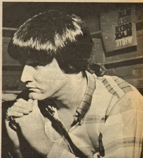
BEAT