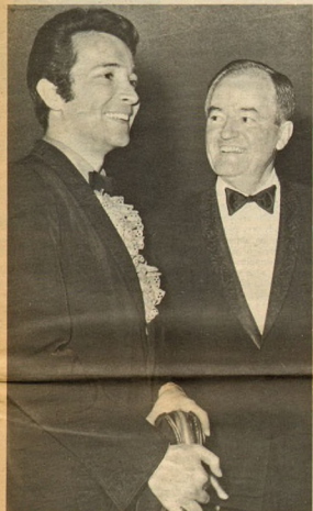
HERB AND HUBERT —Tijuana Brass leader Herb Alpert and Hubert Humphrey, Vice President of the United States, chat briefly after the recent White House Press Correspondents Dinner in Washington D.C. where Herb and the Tijuana Brass performed. The group received the first standing ovation given to an artist in the history of the dinner.