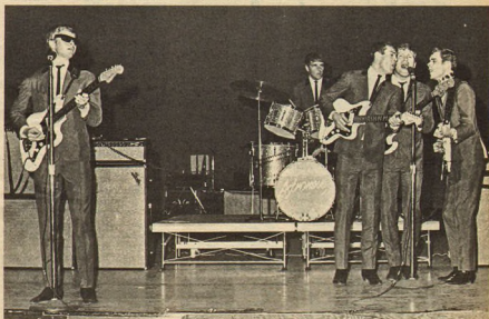
... THE ASTRONAUTS