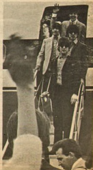
... ARRIVING AUGUST 12

And if you can't possibly come up with enough money to attend one of the 14 Beatle concerts yourself, don't fret. The BEAT will follow the tour along from the time it begins in Chicago until it winds up in San Francisco letting you in on all of the highlights of the entire tour.