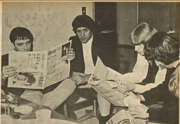
BEAT