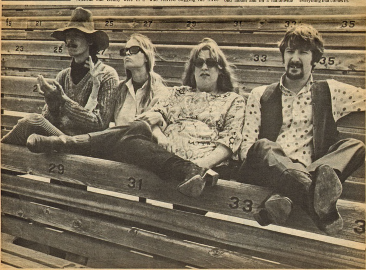
THE MAMA'S AND PAPA'S—John, Michelle, Cass and Denny, reverting to their old Bahaman ways and partaking of their favorite past time—doing nothing. "We just hate to work."