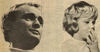
BEST TV SHOW: "MAN FROM U.N.C.L.E." BEST TV ACTOR: DAVID MCCALLUM BEST ACTRESS: HAYLEY MILLS