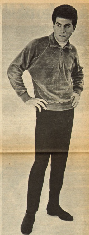
... JOHNNY RIVERS

Despite all that drabble, Johnny told me later that he is in the Guard and that he had just been to Vietnam (as a civilian) to entertain the troops with Ann Margaret. Oops, I don't think I wrote that