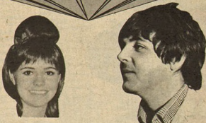
BEST FILM OF 1965: "HELP!" BEST ACTOR: PAUL MCCARTNEY BEST TV ACTRESS: SALLY FIELD

Here's the news you've been waiting to hear!