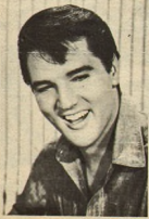
... ELVIS PRESLEY