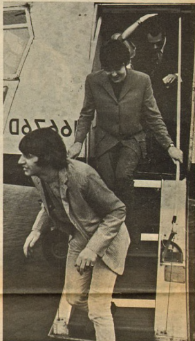
... RINGO AND PAUL STEPPIN' DOWN STATESIDE

And so it went in every single city where the Beatles spent more than a few hours. It bothered everyone but the Beatles. Paul once told The BEAT that the Beatles weren't at all disturbed because they saw what they wanted to see and went where they wanted to go. And they did too. They popped up at recording sessions, night clubs and Elvis Presley's house. The people who the Beatles wanted to meet or old