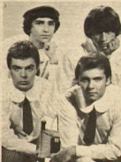
... YOUNG RASCALS