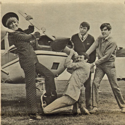
... CILLA BLACK PREPARES TO TAKE-OFF WITH THE BACHELORS INSTEAD OF FREDDIE.

Freddie and his Dreamers have just completed their American tour and have recorded their "Short Shorts" stage routine for release as their next Stateside single. They've been having considerable difficulty lately in producing a hit single here in America. But they're going to give it another try with the old "Short Shorts"—Freddie style.