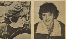
... IN DENIM

THE EVER CHANGING DONOVAN — When he first came on the scene he appeared in denims and an old railroad cap and he sang about the wind and colors and things. After "Universal Soldier" was a huge hit for him, he disappeared for a while, then came back wearing velvet capes and ruffled shirts. Now he's back again with "Sunshine Superman" and he's become a man of theworld in padded shoulder suits and immaculately styled hair.