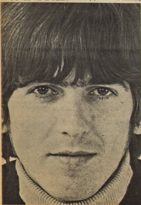
... OBJECT OF BEATLE HUNT