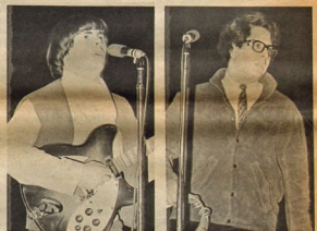
... AL "EASY SMILE"