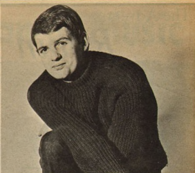
... CLIFF BENNETT

By the time The Beatles returned from Japan, Manila and New Delhi, Cliff was ready to take the new number into the recording studio. In fact, Paul attended the two sessions at which "GOT TO GET YOU INTO MY LIFE" was recorded. Cliff no longer works with an A & R man—he produces all his own records. On this occasion an unofficial assistant in the production of the session was Paul McCartney! Rush release for the Cliff Bennett single was organized and it came out in the U.K. on Friday, August 5—