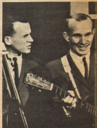
THE SMOTHERS BROTHERS lost their television series but have come up with featured roles in an NBC special, "Alice Through The Looking Glass." The special is set to air Nov. 6.

Allen's injury follows on the heels of a riot involving the Fortunes when they played the Isle Of Man. Rod escaped injury then but two of his fellow Fortunes were not so lucky.