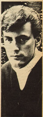
... TOMMY JAMES

And so the mysterious circumstances behind the death of one of America's brightest young singers—a fellow who obviously had everything to live for—still remained unknown.