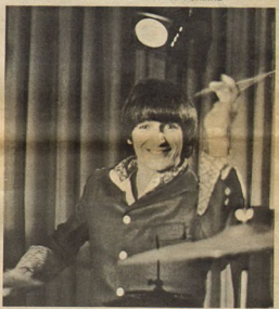
BEAT Photo Chuck Boyd