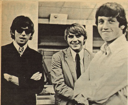
... THE MINDBENDERS (l. to r.) Eric Stewart, Bob Lang and Ric Rothwell