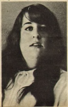
... MAMA CASS