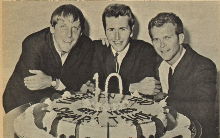
AN ANNIVERSARY CAKE is enjoyed by The Kingston Trio (from left), Nick Reynolds, John Stewart and Bob Shane, at The Sahara Tahoe where the famed singing group is celebrating its 10th anniversary in show business. The cake was a surprise present from Mrs. Elva Miller, who is appearing at the hotel with the trio. The trio will record a 10th anniversary album for Decca release while at the Sahara Tahoe.