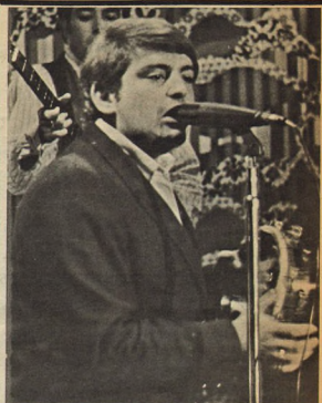
... HOWARD KAYLAN — THE "KING"

And now it is two and a half years later. The Beatles will be returning very soon, and perhaps there will be other Beatle-hunts, in other places, with other Beatlemaniacs. Because Beatlemania, is indeed, an incurable disease—but probably one of the greatest and most enjoyable afflictions known to the human race.