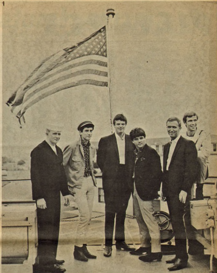
GARY LEWIS AND THE PLAYBOYS with their sailor host at the U.S. Naval Training Center in San Diego, California. As guests of the U.S. Navy, Gary and the group performed two concert shows for more than 20,000 service men and then were given a "grand tour" of the base and ships.

TERIAL. Without doubt some younger Beatle People will find at least three or four of these recordings too complicated, too intelligent (musically) and/or too weird. On the other hand there is more than a fair sprinkling of perfectly straightforward performances ranging from Ringo's simple but extraordinarily infectious "Yellow Submarine" to the rocking "Doctor Robert" from the thoughtful "Eleanor Rigby" to the boisterous "Got To Get You Into My Life." On listening to the whole album, it becomes plain that The Beatles didn't waste any of those days and weeks between Easter and the June tour of Germany. Every track has been produced with perfectionist polish—one took over 55 hours of recording time to complete! Nobody is likely to be disappointed by the finished product—and that, after all, is the aim of any recording artist.