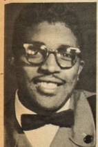
... BO DIDDLEY