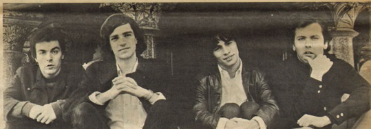
THE YOUNG RASCALS have just been awarded a Gold Record for their nationwide number one, "Good Lovin'." It marks the first Goldie for the group who received public recognition last summer. Their debut disc, "I Ain't Gonna Eat Out My Heart Anymore" was a fair-sized hit and they immediately followed it up with the million selling "Good Lovin'." They are scheduled for a series of one-nighters August 10-20 throughout California and then are to appear for one week in Hawaii. Tentative plans now have them scheduled for their European debut in October.