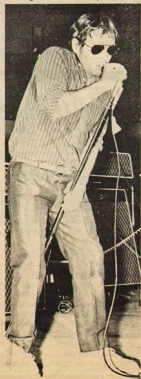
... ERIC BURDON—solo singer.

Eric Burdon is set to record his first solo effort upon his return from the U.S. The search for suitable material is already on but apparently nothing has been found yet.