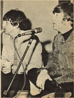
... MCCARTNEY AND LENNON—TRIPLE WINNERS!