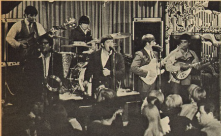
BEAT Photo Chuck Boyd