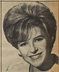
BRENDA LEE has been forced to cancel engagements for the first time in her 11-year career. An ear infection has become serious enough to confine her to her home in Nashville for at least a month.