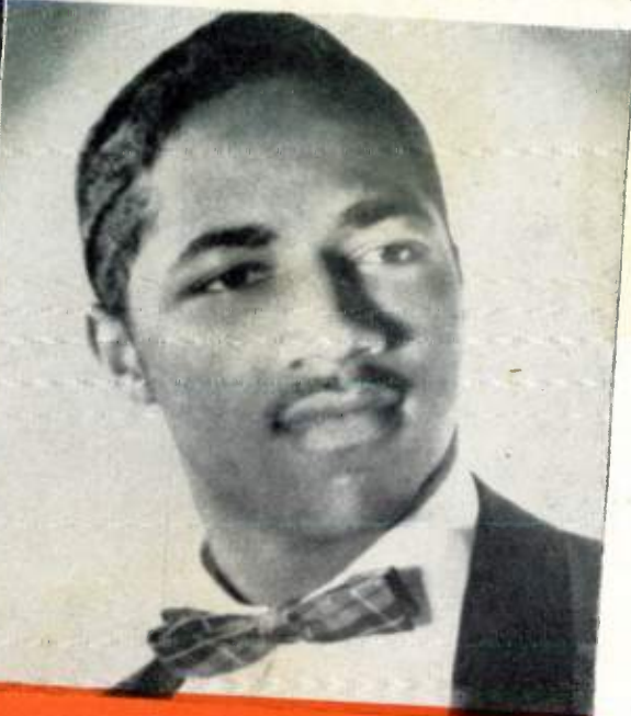
DEE CLARK'S "JUST KEEP IT UP"

Dee Clark's "Just Keep It Up", which exploded from nowhere to the top of the charts within six weeks, promises to be only part of a chain reaction triggered some months ago when Veejay-Abner Records presented his pop smash "Nobody But You".