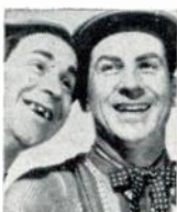
LONZO & OSCAR