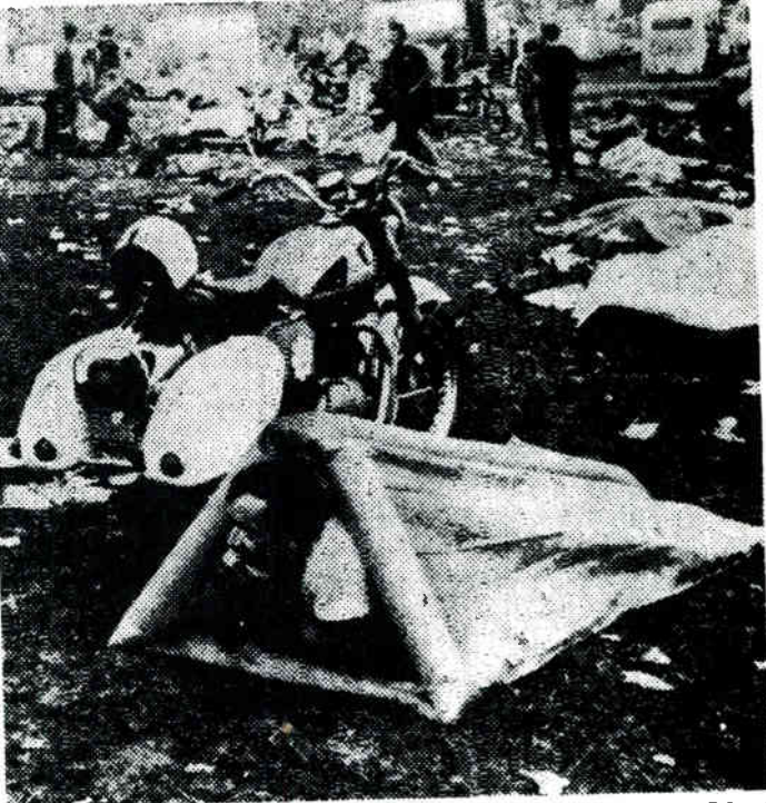
LIVING QUARTERS were not always satisfactory. Most people stretched sleeping bags on the rain-soaked grass.