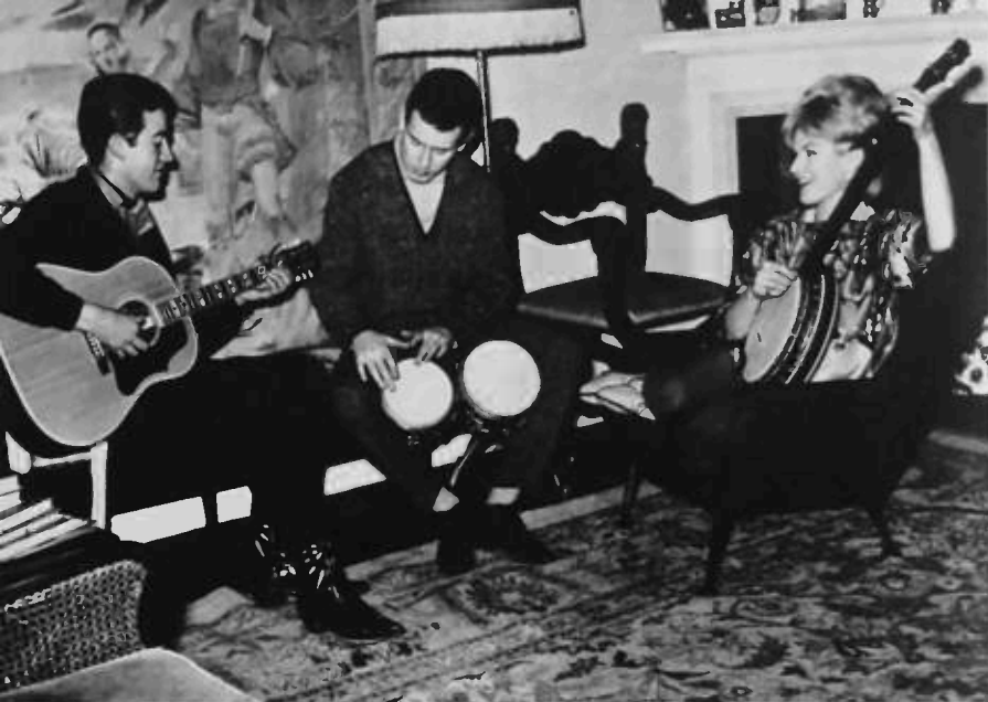
An informal practice session at Dusty's Baker Street flat.

"Sounds as though someone is going to cut us off" says golden-haired Dusty, as Mike pretends to scissor the phone wire.