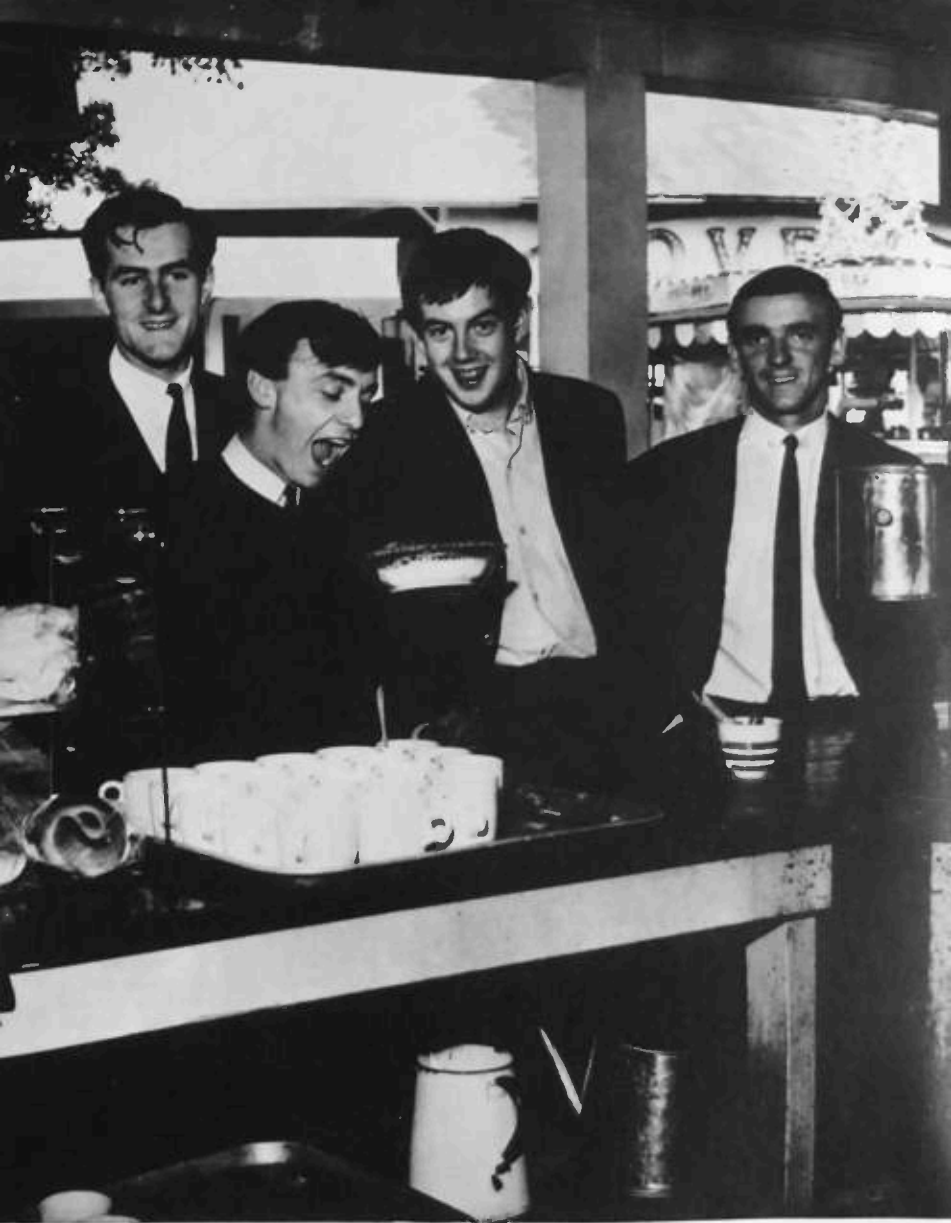
Gerry Marsden whoops with joy at the sight of a bowl-full of sugar. He has, to put it mildly, a sweet tooth.