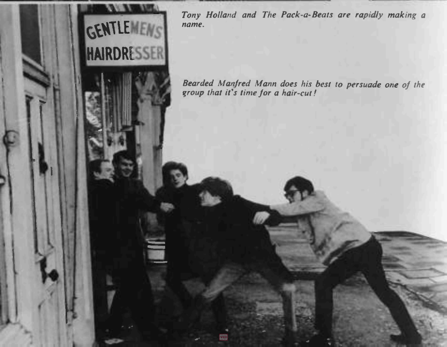
Bearded Manfred Mann does his best to persuade one of the group that it's time for a hair-cut!