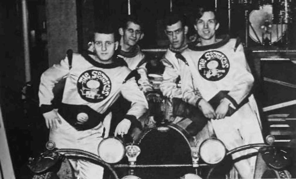
The Spotnicks from Sweden are another group who had a very successful tour here during 1963