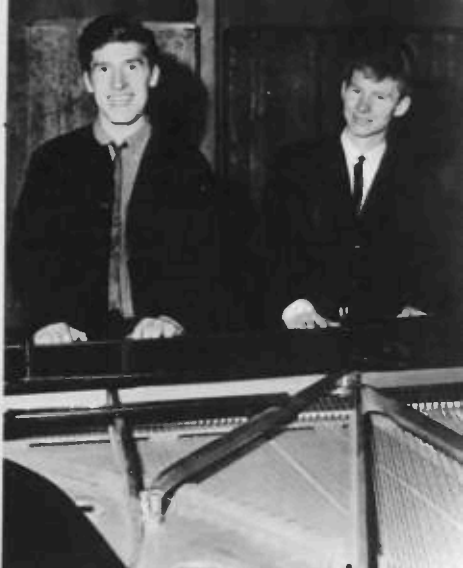
Searching for a tune for a four-handed duet.