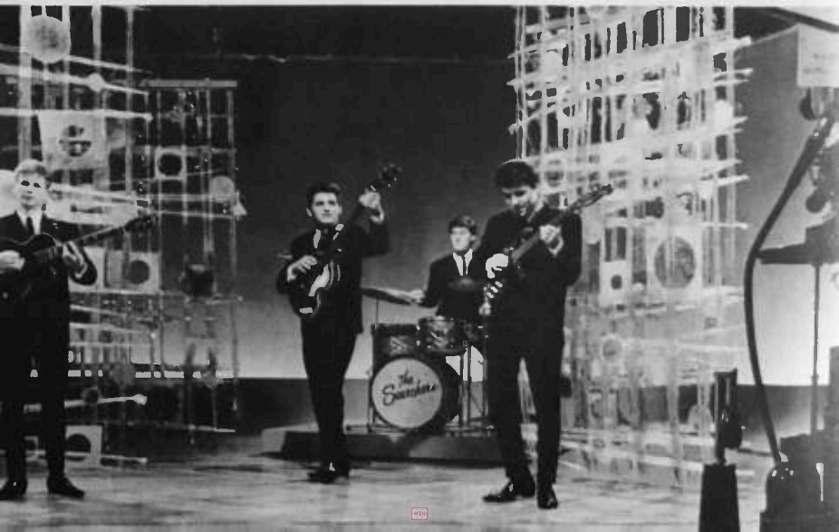
Rehearsing for ABC-TV's "Thank Your Lucky Stars".