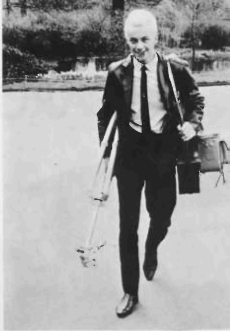
"Chewing a leaf helps me concentrate when I'm out with a camera—one of my pet hobbies."

The Saints have a whimsical sense of humour!