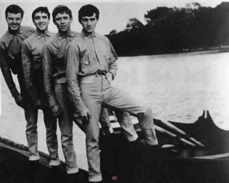
The actual blue jeans you've heard so much about.