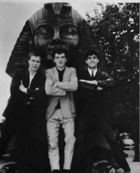
The three six footers pose against Cleopatra's needle on the Embankment.