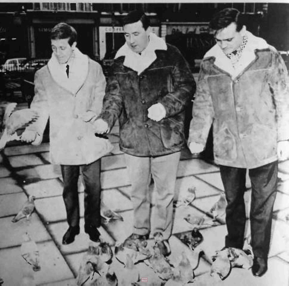
The Karl Denver Trio caught here feeding the birds in Golden Square.

But on the next few pages you'll find a crazy mixed-up selection of the Top Ranking Beat Groups together with some who may be topping the polls even before the printer's ink is dry.