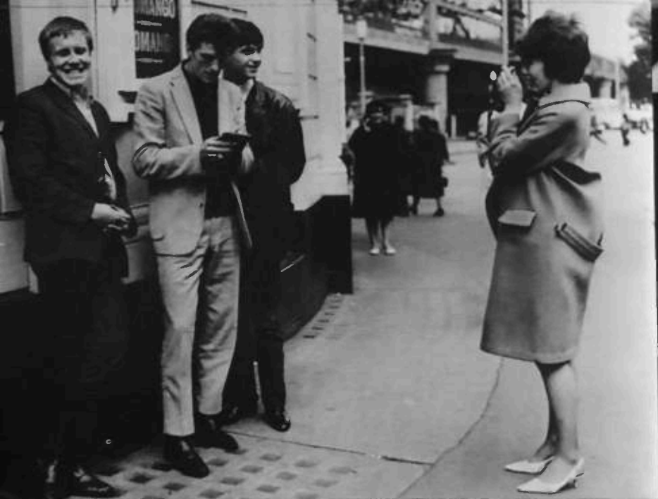
It's The Big Three (and not, as you might guess Johnny and the Face-makers!) posing for a fan outside the BBC's Playhouse studio.