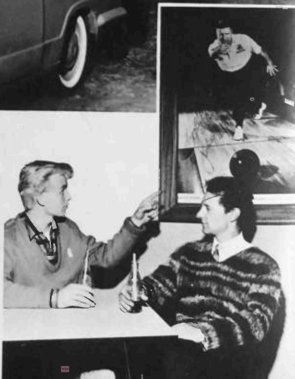
"Don't look round now but someone is howling you over!"