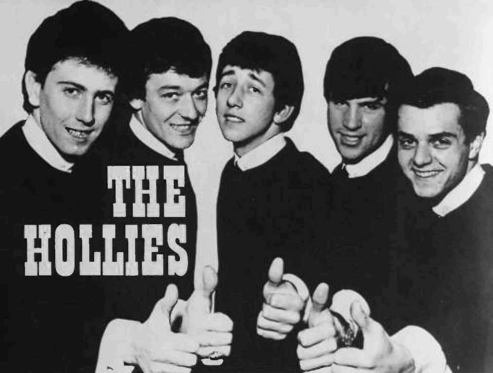
"Thumbs up" say Graham, Allan, Tony, Eric and Don (reading from left to right).

GRAHAM NASH leader of the Group, rhythm guitarist and vocalist, born Blackpool, February 1942. Moved to Manchester where he sang in the choir, in operatic shows and in his school's minstrel group. Worked in an engineering factory and behind a Post Office counter. Graham is 5ft 10½ins tall, weighs 10 stone, has brown hair and blue eyes. Had been a member of five other groups before settling down to the Hollies.