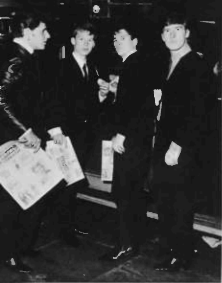
The week's serious moment—when we learn from the musical papers—where we stand in the charts.