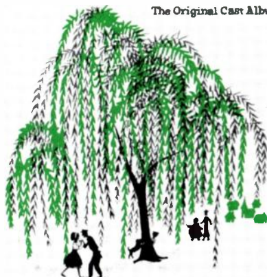
The Original Cast Album

Frank Loesser's best score in years. Winningly performed by Anthony Perkins (in his musical show debut) and other stars of the original Broadway cast.