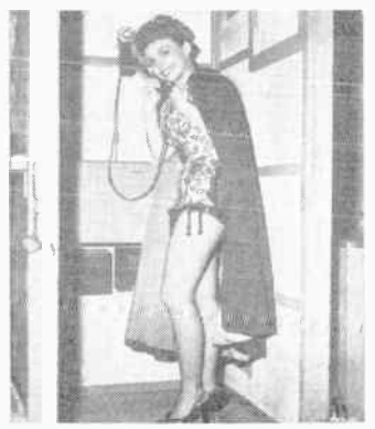
Teresa Brewer, who sounds like a big little girl, photographs like a little big girl in Pine-Thomas' production, "Those Redheads From Seattle." She's still "Waltzing."