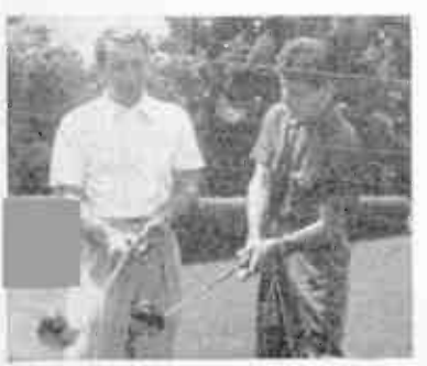
Perry Como gives golf tips to Eddie Fisher at Garden City Country Club, N Y. But there's no evidence that Fisher needs tips on other common interests, like records.