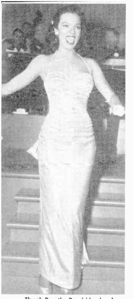
Thrush Dorothy Dandridge has been signed up to co-headline the Texas State Fair, Dallas, this October. Singer also stars in "Bright Road."