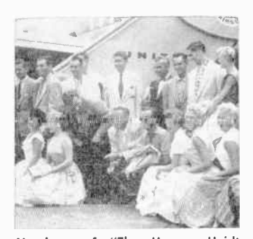
Members of "The Horace Heidt Show" take off for Korea where they entertained the first U.S. prisoners released in "operation big switch." U.S. requested the tour.