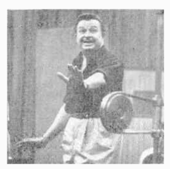
Rhumba expert Xavler Cugat waves his brass down at Victor recording session. The result is a new disk with the double-up title of "You Too, You Too." Flipside: "Chivirico."