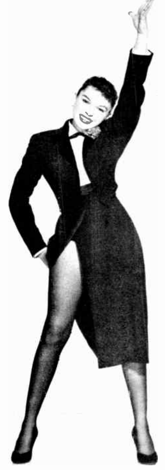
The Garland gam is once more on display in theaters all over the country, which pleasant fact is brought about by release of her Warner picture, "A Star Is Born."