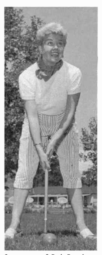
Croquet anyone? Doris Day sharpens up her form and selaxes after completion of Warner Bros. musical, "Young at Heart," in which she's properly paired with Frank Sinatra.

In case you were wondering, maracas, bongos, castanets and claves are musical instruments. Their musical status became official when the Office of Internal Revenue ruled they were subject to the same manufacturer's excise tax as musical instruments.