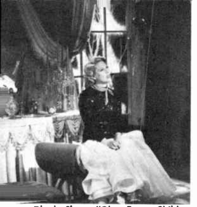
Dinah Shore "Give Every Child a Chance" in film "Six Star Salute" which kicks off United Community Fund-raising Campaign for 1954.