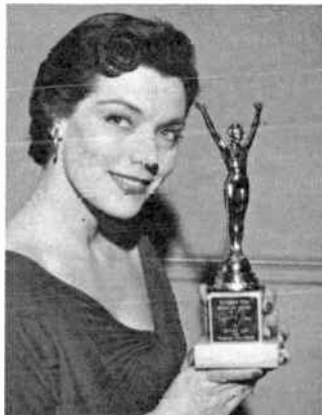
Denise Lor, lovely TV, record star holds Brascar Award given her by columnist Earl Wilson for "exquisite form on records." Her latest Majar disk, "And One To Grow On."

In case you don't eat Wheaties, you can still buy the more conventional recordings at your local record dealer.