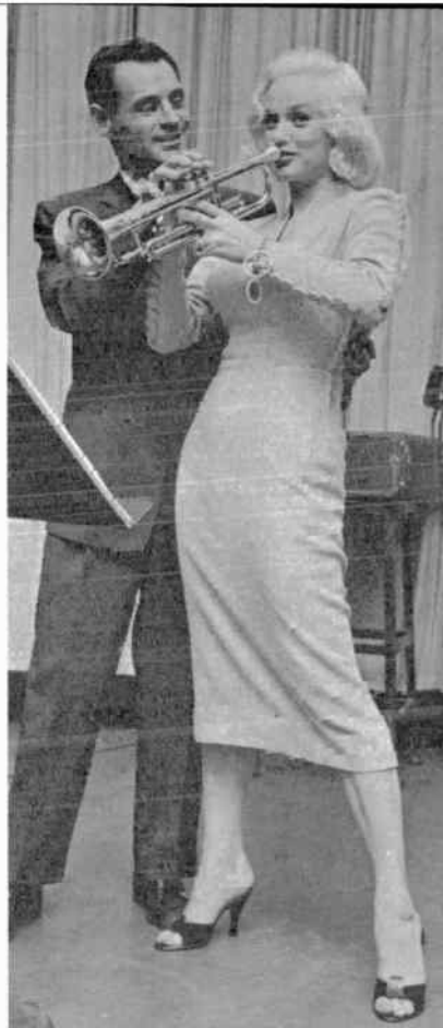
Ray Anthony shows actress Mamie Van Doren how to produce the wonderful trumpet sound which characterizes his brand new Capitol 12" album titled "Golden Horn."