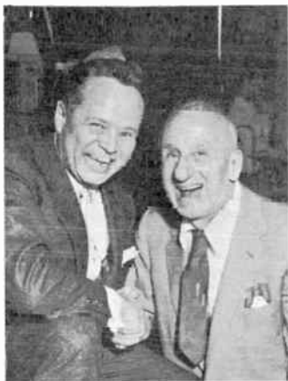
Jimmy Durante admits his voice is not up to that of Billy Daniels but he is louder due to nasal resonance. Grins were result of a Las Vegas meeting of the pair.