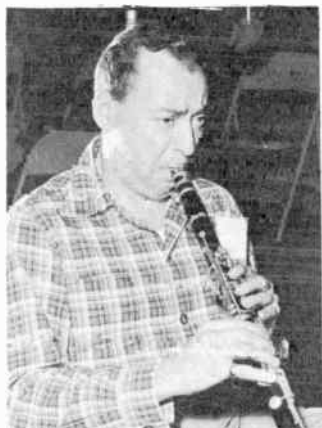
Woody Herman is usually pretty gay on the bandstand but during rehearsal he is intent as above. Result of rehearsal was a session & album, "The Woody Herman Band!"