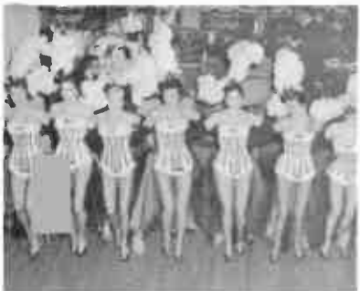
One of the prettiest lineups in Hollywood night spots are these Cuties entertaining at Ciro's where the Movie Names, Texas Oilmen and Tourists meet in merriment.