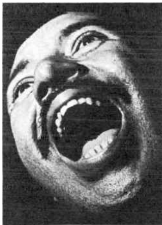
He's responsible for the Mambo addiction which has swept the nation. It's Perez Prado, caught in the act of shouting Mambo word, "ugh!"