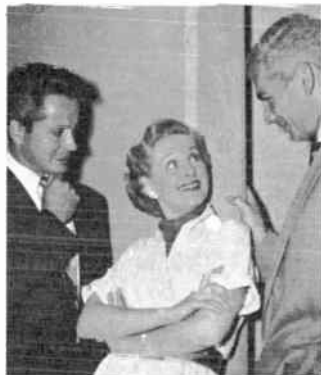
Connie Moore receives the congratulations of John Derek and Jeff Chandler during her engagement at the Last Frontier in Las Vegas.