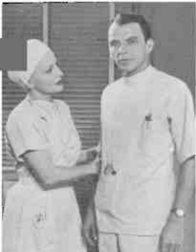
Olivia de Havilland and Frank Sinatra in dramatic moment from Stanley Kramer film, "Not As A Stranger," taken from the Morton Thompson best-selling novel.