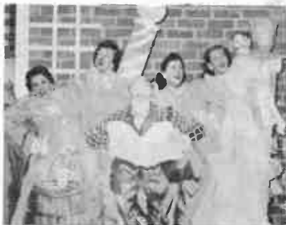
The Chordettes, one of the few female barber shop quartets, revert to type during a visit to The Last Frontier Village, Las Vegas. Their "Mr. Sandman" put 'em in big-time.