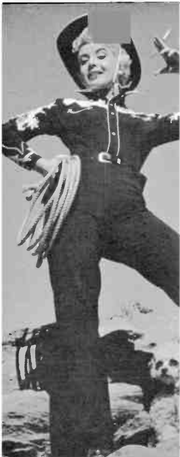
With poodle, "Tiger," Gloria DeHaven gives version of "western" chorus girl. In "The Girl Rush" filmed at the Flamingo, Las Vegas she plays hotel chorus girl role.