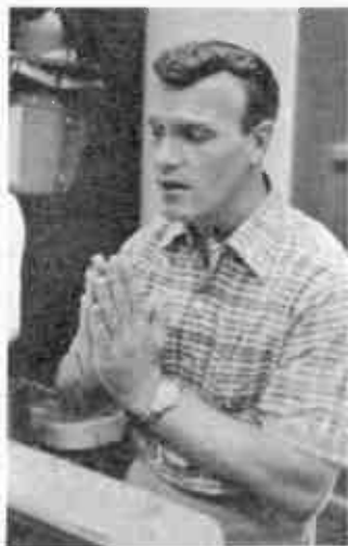
In prayerful attitude Eddie Arnold completes session on "It Took A Miracle" and "I Always Have Some One To Turn To," for RCA Victor.