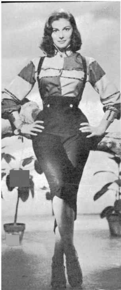
New bride of Singer Vic Damone whose wedding was rated "best of the year" in Hollywood, is wistful beauty, Pier Angeli. She sports the movie "Silver Chalice."