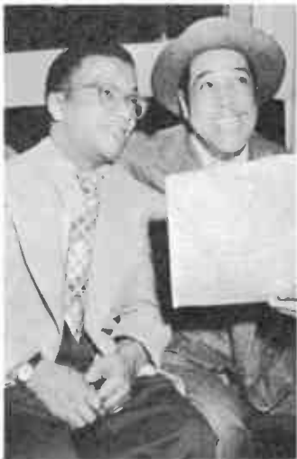
Talent grins with talent as Duke Ellington and his arranger Billy Strayhorn admit it sounds pretty good. "It" is the new Capitol album, "The Duke Plays Ellington."

Tommy Dorsey recently celebrated his 25th year as a band leader. Dorsey entered the band business in 1934 when he and his brother Jimmy formed the first Dorsey Brothers Orchestra. The two brothers were re-united as a bandleading team in 1953. The celebration took place during a recent engagement at the Statler Hotel in New York.