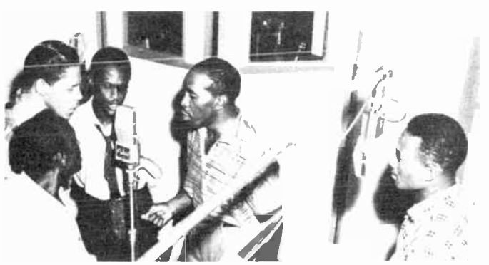
Capitol's Cues gather mikeside to make second record for label, "Charlie Brown" on the "A" side, "You're On My Mind" backside. "Brown" is up-tempo novelty with strange new vocal sounds, other song blues ballad.

The composer collected others from a Turkish dry cleaner, a Welsh engineer, a Greek candymaker, and an Hawaiian guitarist.