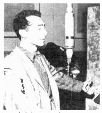
Recorded in England were newest sides by Capitol's Al Martino, "Journey's End"/"Close to Me." Norrie Paramor conducted the date.