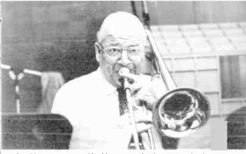
Promising to attract considerable amount of spinners' attention is newest disk out by Pee Wee Hunt on Capital, which includes novel treatment of semi-standard, "Lullaby of Birdland." It's done Dixieland style.