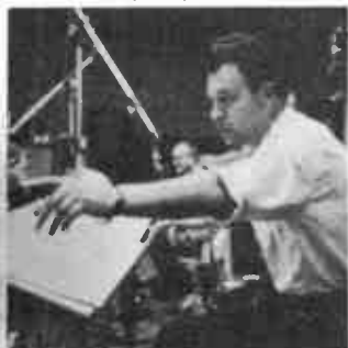
Nelson Riddle's newest Capitol album is "The Tender Touch," newest single, "Farmer's Tango" which is backed by Latin-beat "Could You."