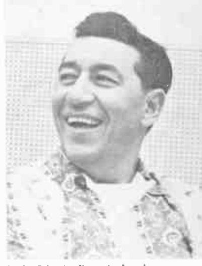
Louis Prima's first single platter for Capitol bears odd title, "5 Months, 2 Weeks, 2 Days" with Sam Butera and The Witnesses.