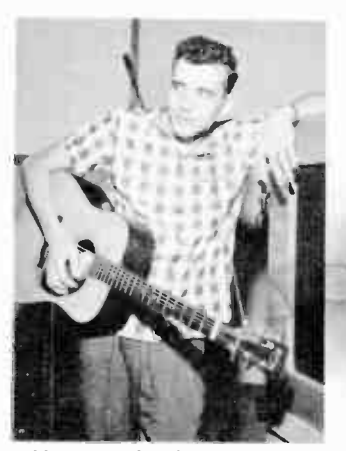
Bobby Bare, barely 21, bows on Capitol with "Another Love Has Ended" / "Down On the Corner." The six-footer lives in California.