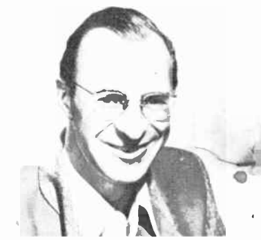
"An English Interpretation of My Fair Lady" is the title of Norrie Paramor's newest album in 'Capitol' of the World series. The instrumental and vocal selections by Paramor and his concert orchestra were recorded in London. Interestingly enough, the album cannot be sold or performed in England because the show has not been cleared for performance in that country.