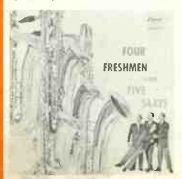
FOUR FRESHMEN AND FIVE SAXES*First Trombones . . . then Trumpets . . now Saxes, the third album in a fabulous series of vocal stylings by the dynamic Freshmen. T844