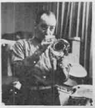
Trumpeter Bobby Hackett dishes up more of the fine sound with which he is identified in a new Capitol album titled "Gotham Jazz Scene."