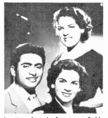
Los Jaranistas is the name of this group which performs on "Music of Peru," one of the recent 'Capitol' of the World albums. The package was recorded in South America.