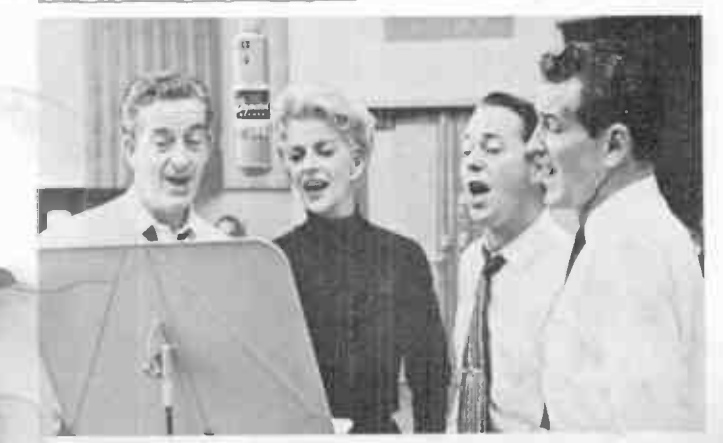
The fine harmony of the Merry Macs has often been copied but never equalled, as their first Capitol album, "The Very Merry Macs" will attest. Such tunes as "Do You Ever Think of Me" and "I've Got Rings On My Fingers" are superbly performed with backing by Frank DeVol's ork.