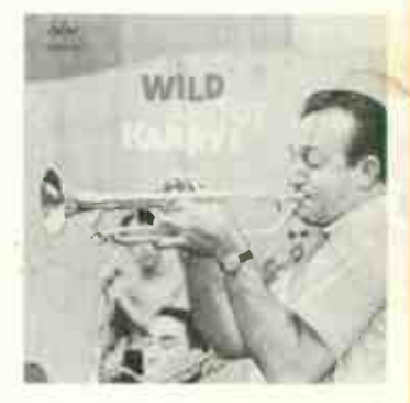
WILD ABOUT HARRY-Harry James and the Music Makers, with all their famous precision and power, in a swinging, danceable package of original tunes. T874