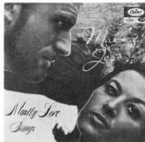
"MOSTLY LOVE SONGS"