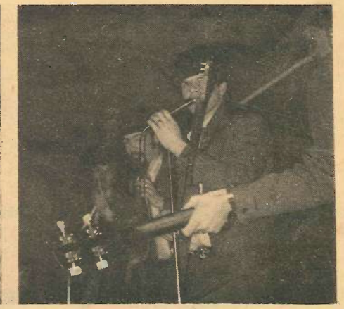
The Stampeders appearing and playing in Labrador City, Newfoundland