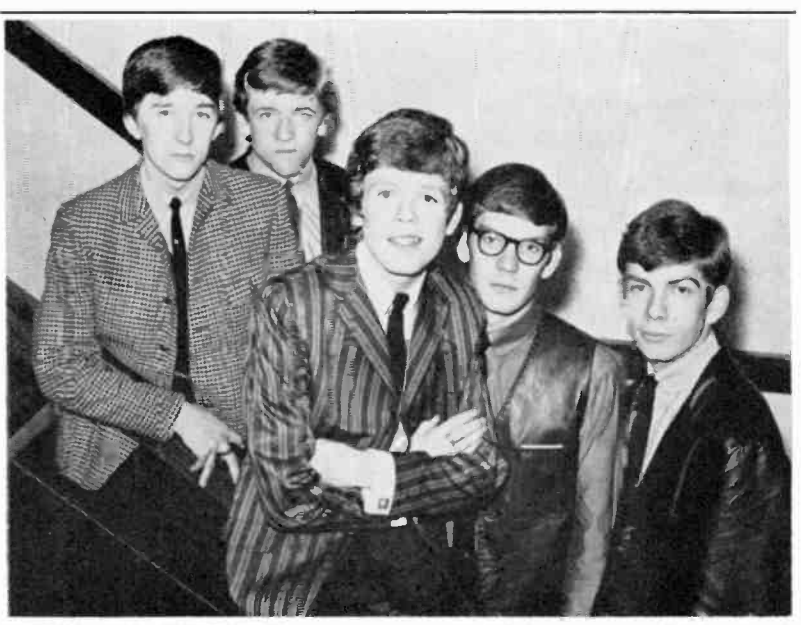
HERMAN'S HERMITS are a new British group which MGM Records is curently releasing on their first American single disk, "I'm Into Something Good." Lads may not be the first English group on the disk scene, but they look like they just might be the youngest.