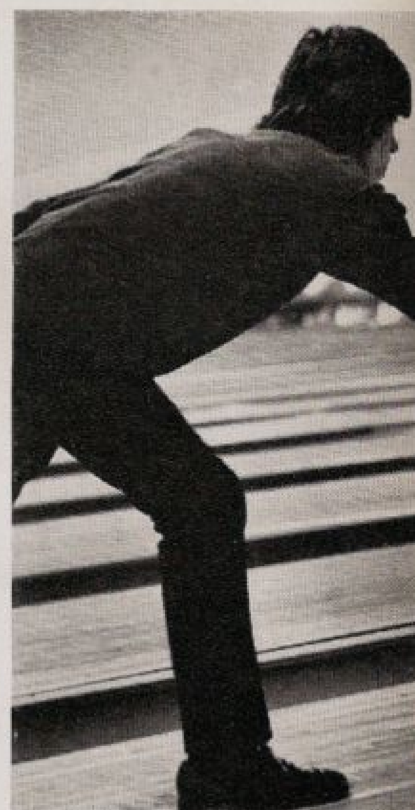
Mick, Bill and Keith show how it should be done when the Stones went bowling in Hollywood. Who do you reckon has got the best action?