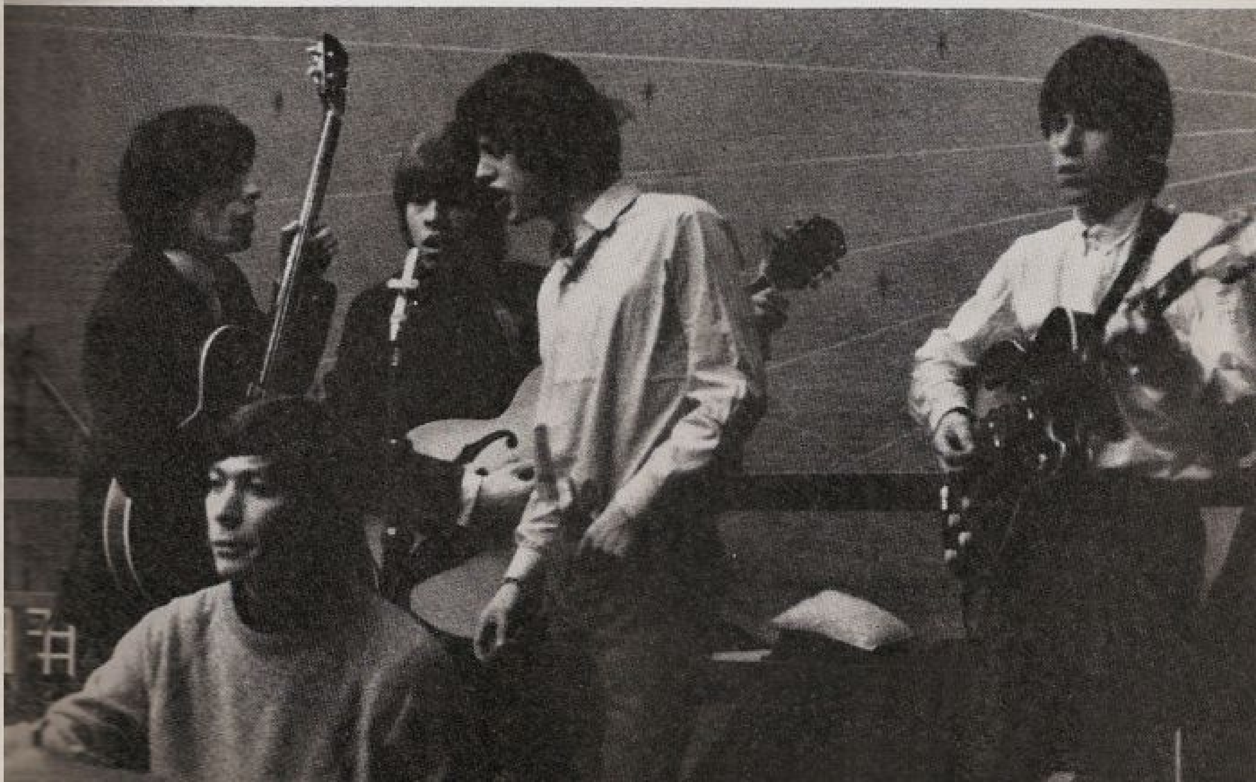
An early pic of the Stones in action with Charlie and his drum kit way out in front of the three vocalists on that mike behind him.