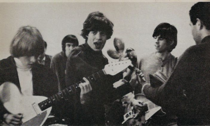
ABOVE: The Stones warming up for their Ed Sullivan appearance.