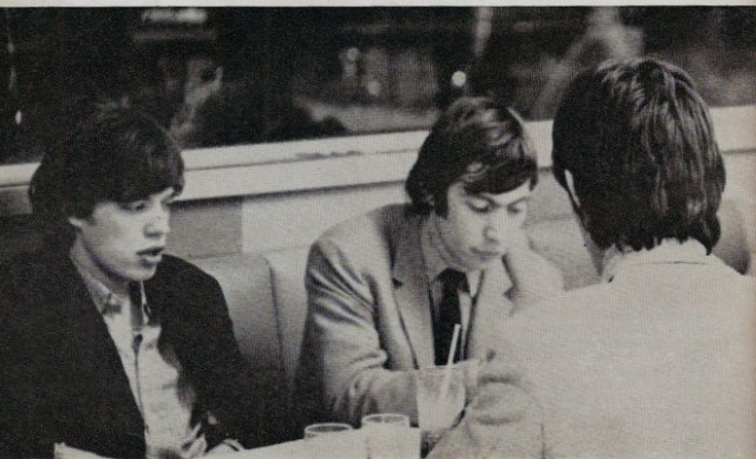
BELOW: Time to relax and enjoy a quiet break after their Cleveland date.