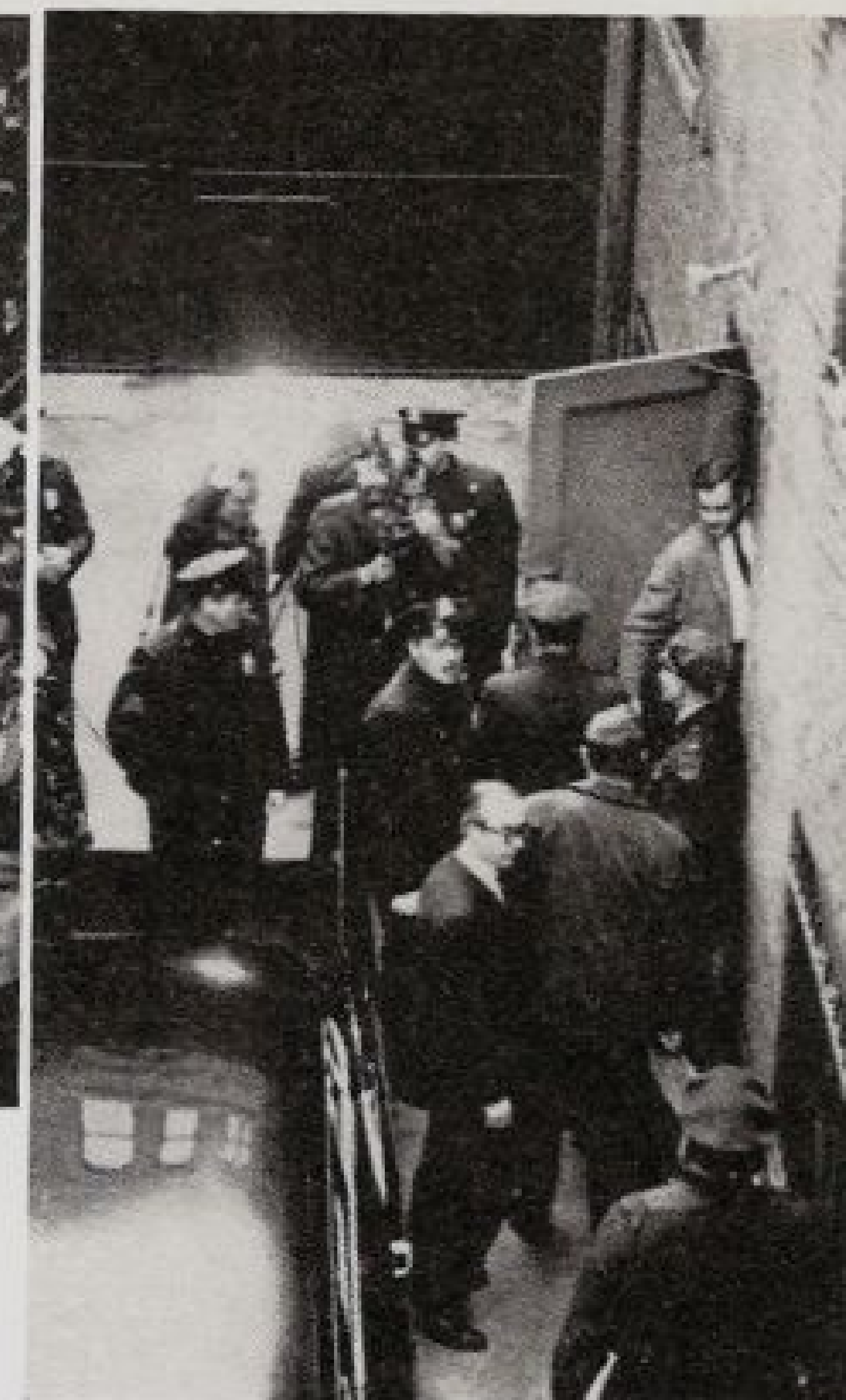
The boys' car arrives at the Academy of Music in New York.