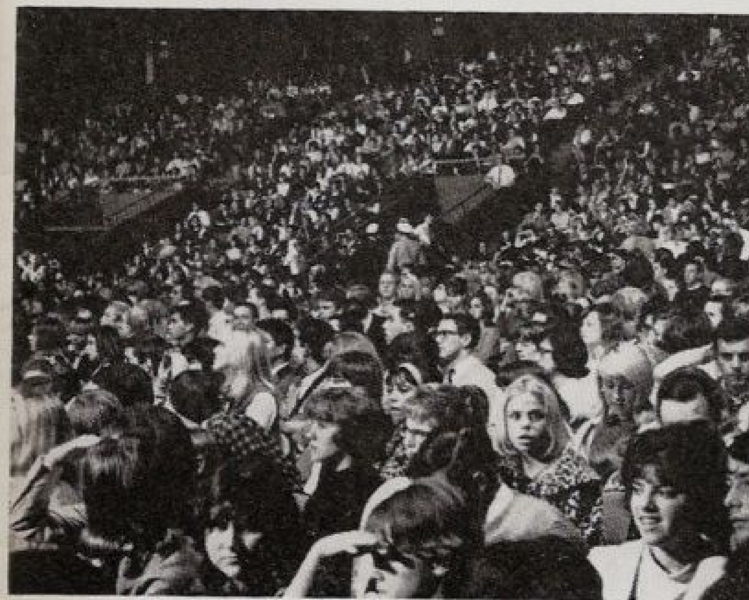
Part of the huge audience for the Electronovision show in which the Stones appeared in Santa Monica, California.

Two of the Stones have cats as pets. Brian Jones was quoted in a magazine as saying he liked the Manx breed, the tailless variety, and an admirer promptly sent him one. Charlie Watts has got a Tortoiseshell-coloured kitten, which spends most of its time tearing around the floor of his flat!