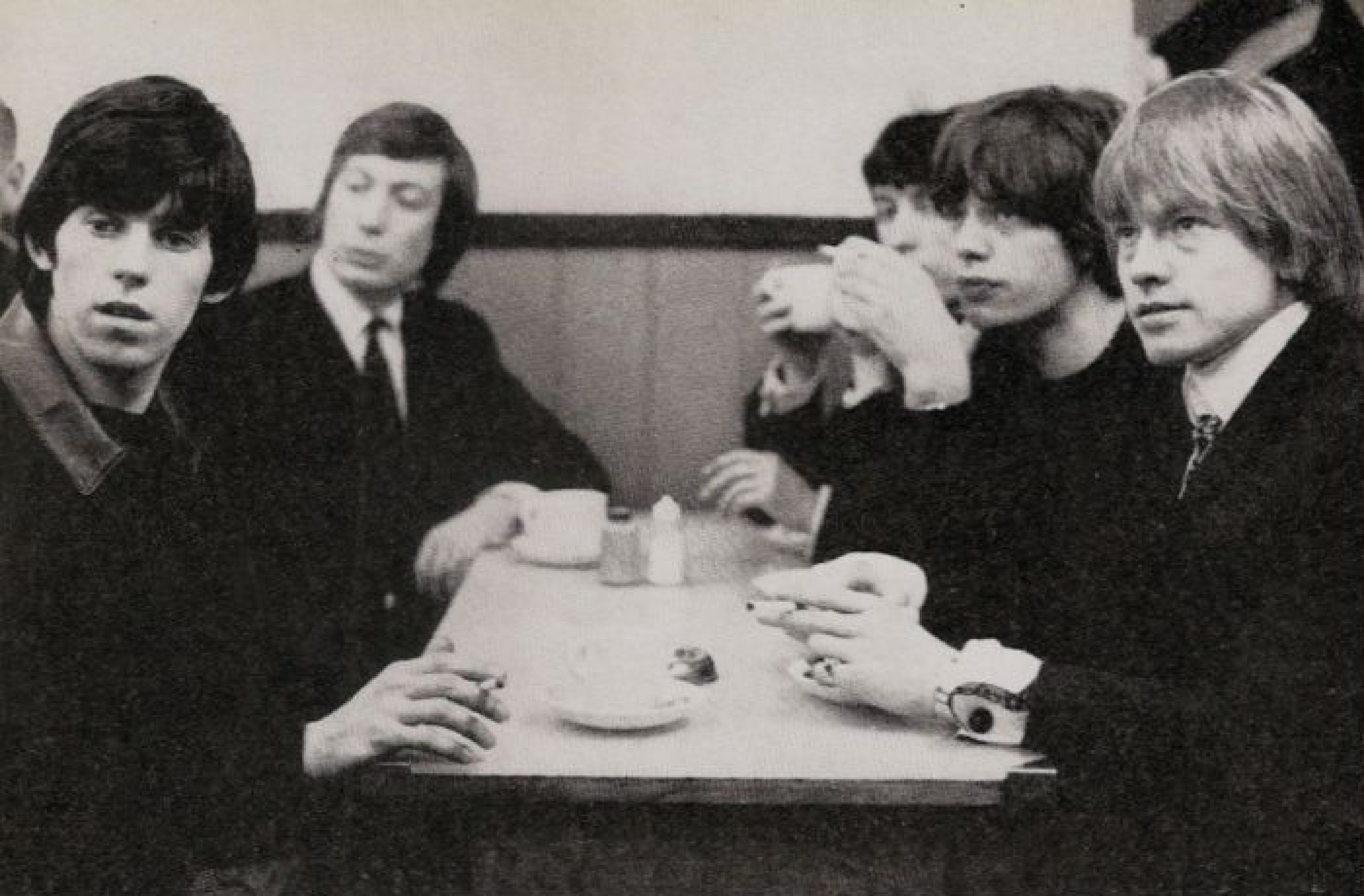
The Stones get ready to answer a reporter's questions while they have a break for a smoke and a cuppa on tour.

tremely scruffily dressed. Rather better turned out was Ian Stewart—an old acquaintance of Bill's. He was someone well known on the R and B circuit in the London area.