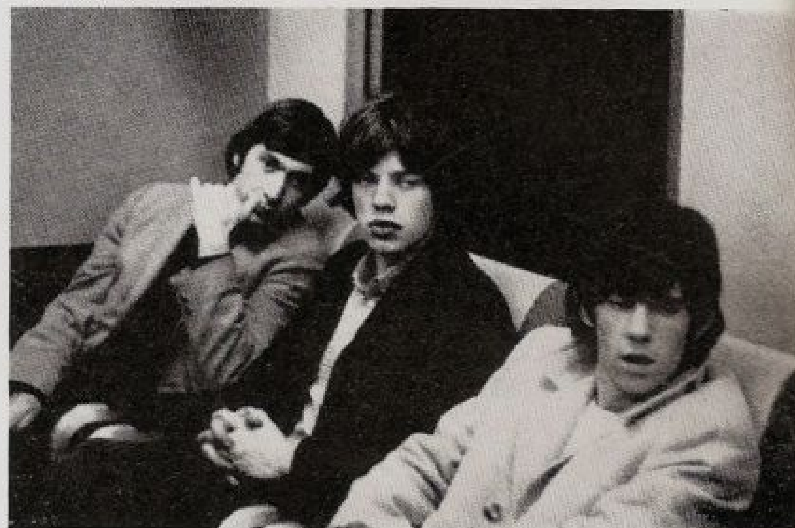
Three Stones relax on the night train to New York from Rhode Island.

Question: Which studio will the Stones choose as their favourite recording rendezvous? Almost every artiste finds that one particular recording studio turns out far more hits than any of the others. But already Regent and Chess have turned up trumps. Will their next No. 1 come out of R.C.A.? If it does, then it more or less proves that the boys can use any studio to produce a hit.