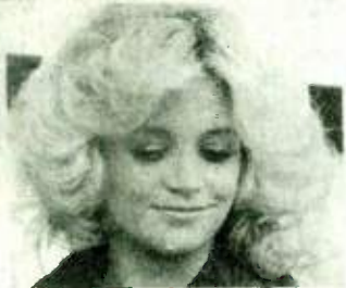
Mandrell Page 7

Phasing out the Metro Radio Sales operation is expected to take between 30 and 60 days.