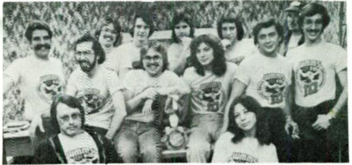
The "WMMS Family" shows off the buzzard T-shirt.

RMR: Are all the properties pretty well settled in...in other words...Is the corporation going to unload or trade some properties.