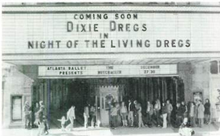
Macon, GA. While the new Dixie Dregs album, Night Of The Living Dregs , won't be released until mid-March, the recent marquee display at the Fox Theater in Atlanta drew quite a crowd of onlookers. The marquee shot is being used by Capricorn Records for a number of merchandising, promotion, and publicity previews.