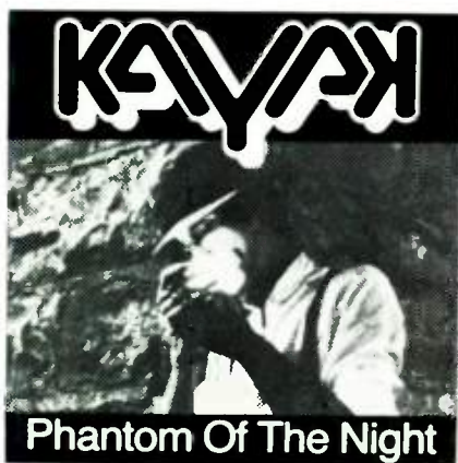
Phantom Of The Night