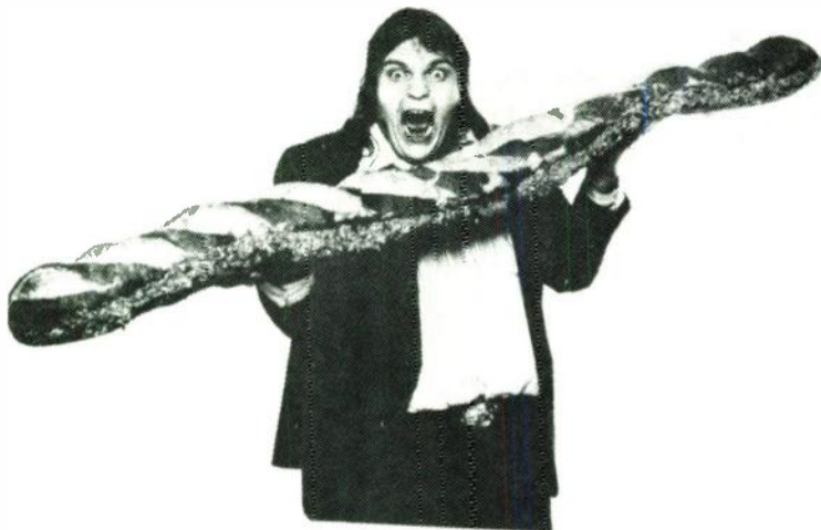
Meatloaf is one of the rock stars that WMMS "broke" for the country.

Kid: Yes. Kids have approached me and said that they think I'm great, etc. and that they want to be like me. I think it's a great compliment. I don't think I'm doing anything wrong. They can learn from me, and they can learn from other stations that they listen to. I tell them never to imitate...just learn the tricks and apply them to yourself.