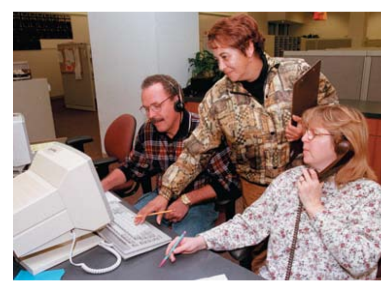
Arbitron's Interviewing Center places more than four million calls every year to randomly selected households.

Each quarter, the data are then released electronically as the Arbitron eBook and through various other services, such as Maximi$er®, Tapscan®, Arbitron Integrated Radio Systems (IRS)<sup>SM</sup> and third-party processors.