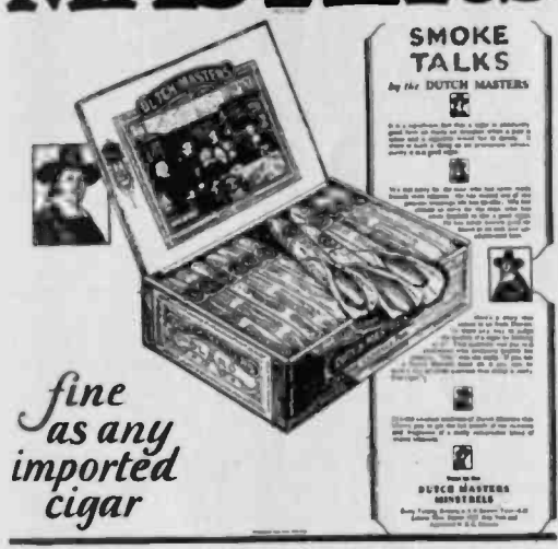
Reproduction of Full Page Newspaper Advertisement

paper schedules to run on Tuesday, the day our program went on the air. This permitted a closer association between these two major types of the company's advertising. The full page newspaper exhibited here will show how the broadcasting program is mentioned.