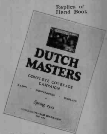
Size 5" x 7"

Newspaper Advertising We reconstructed our news-