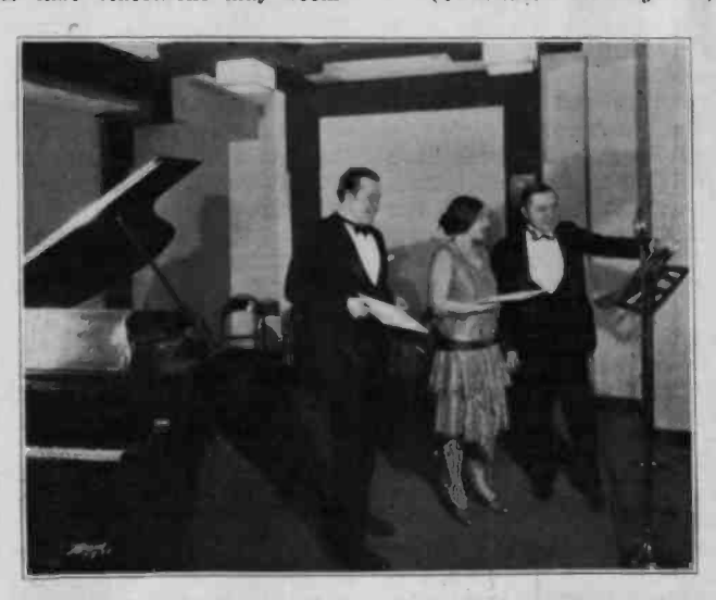
Three Members of the "Evening in Paris" Company at Rehearsal