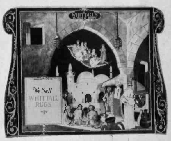
Display Card for Dealers