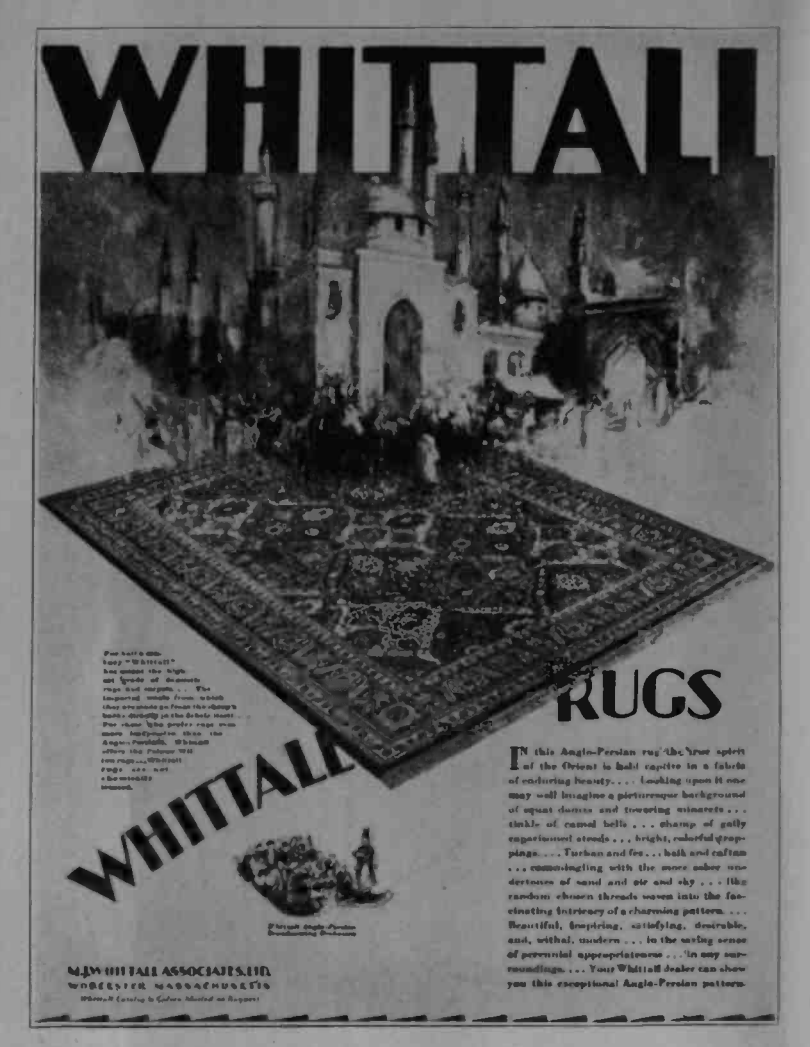
A Four-Color National Magazine Advertisement

this program were so gratifying and the response of the Radio Audience so enthusiastic that Whittall executives were forced to give broadcasting, as a national advertising medium, more serious consideration.